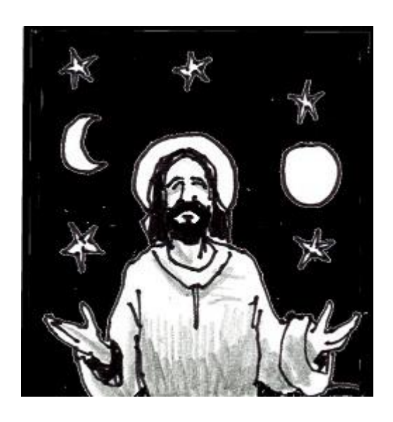
"I am the light of the world" (John 8:12).