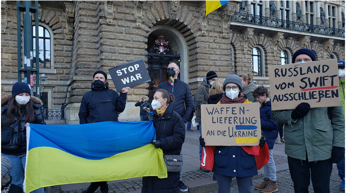
A demonstration against the Russian invasion of Ukraine in late February in Hamburg, Germany

I want to be careful here. I don't want to overstate the similarities between the Holocaust and Russia's invasion of Ukraine â?? there are quite obvious differences, including the fact that Russia has not embarked on a campaign of racial extermination against Ukrainians. (However, there are growing concerns that, in targeting civilians, Russia is committing genocide and may be seeking the elimination of the Ukrainian nation.) In short, here we are, once again, facing more dehumanization, more killings and more death on the continent of Europe.