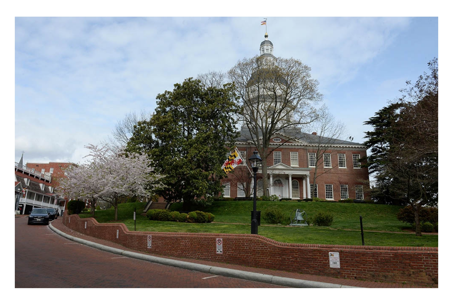
The Maryland State House is seen in Annapolis March 31, 2020.

The Maryland League of Conservation Voters called the Climate Solutions Now Act "a historic breakthrough" after a similar bill failed last year and said that overall "the session may be remembered as one of the most successful and momentous in decades."