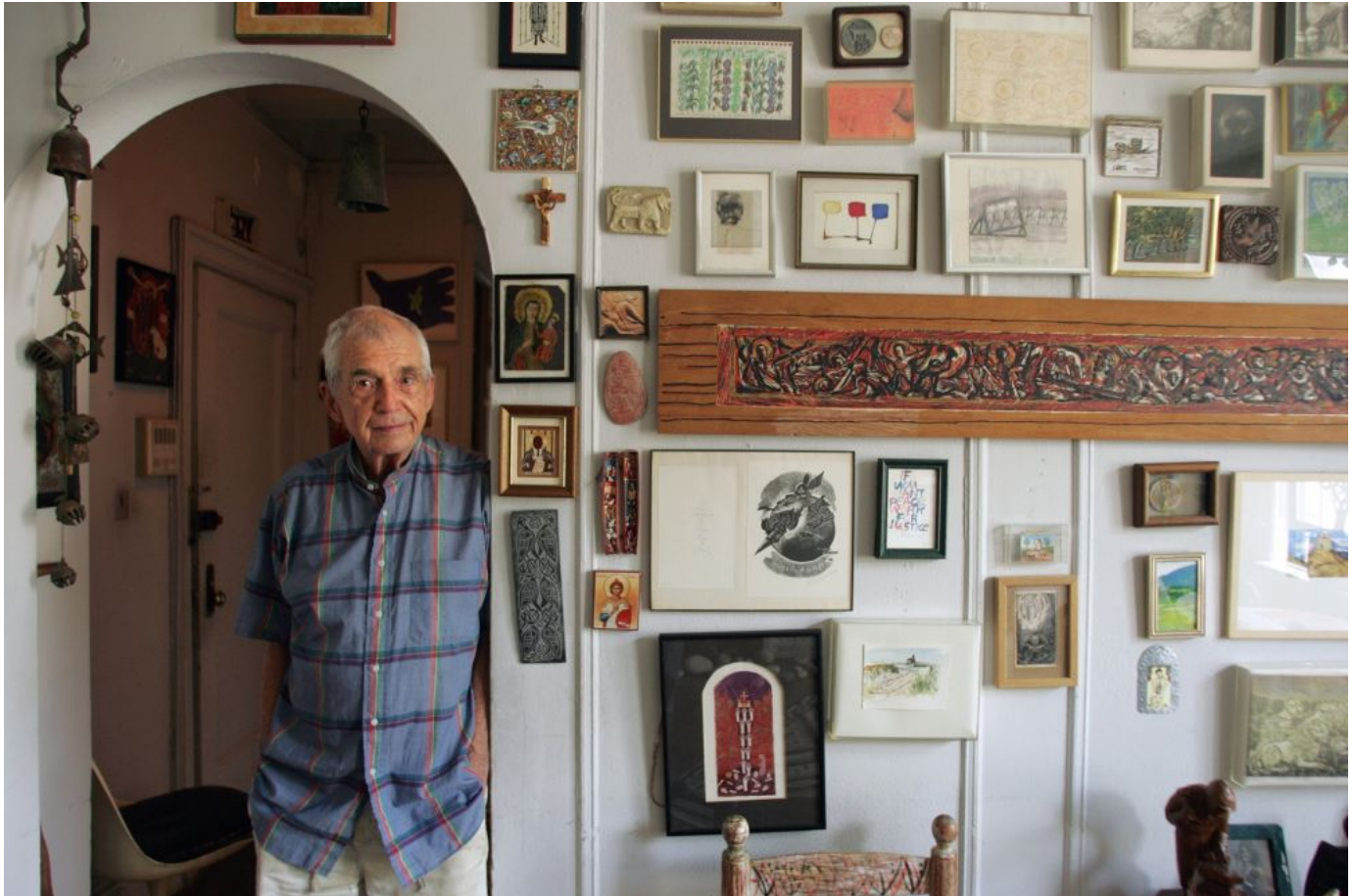
Jesuit Fr. Daniel Berrigan, then 85, poses in his New York City apartment in 2006. Berrigan died in 2016 at age 94.