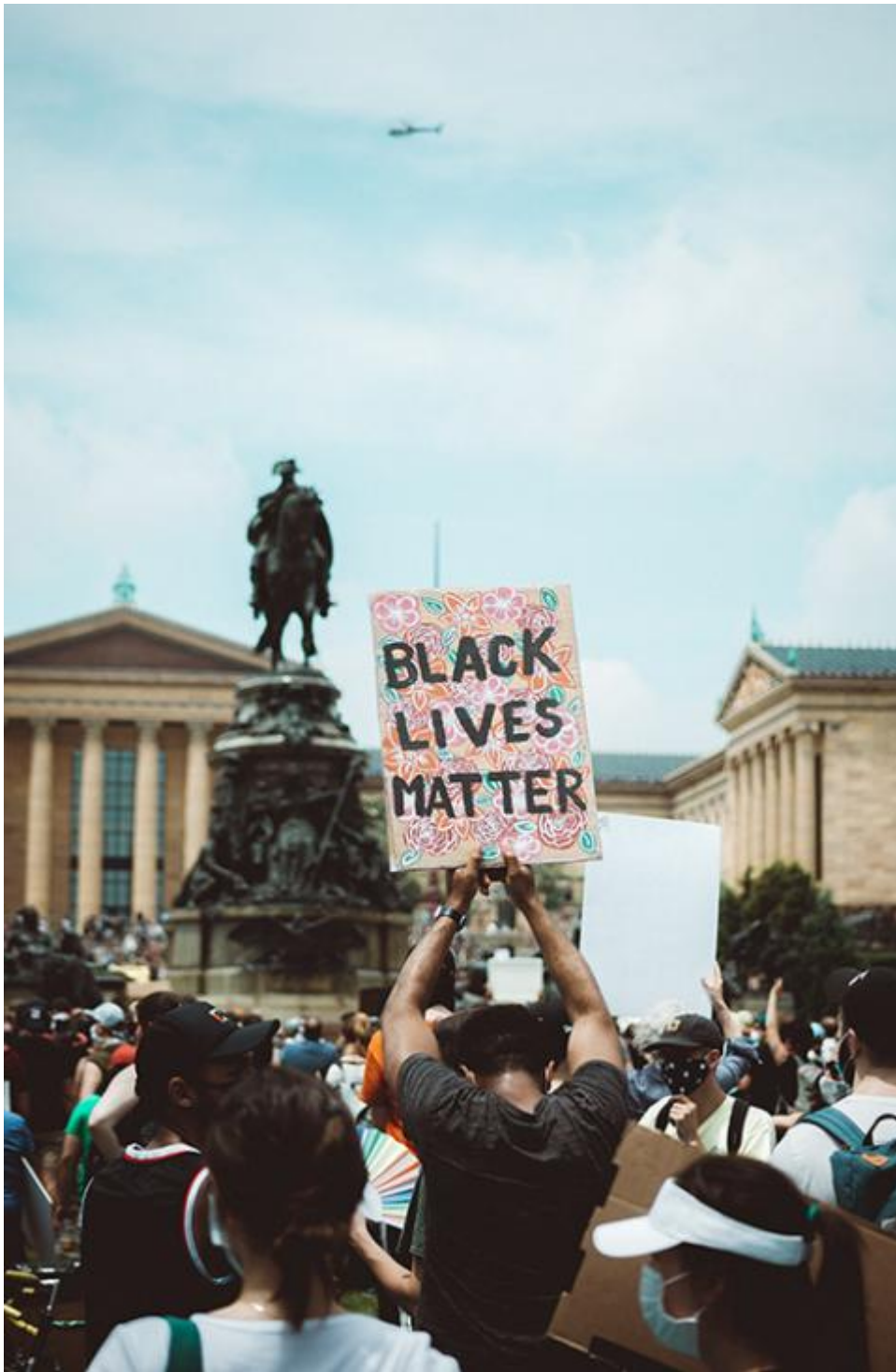
Philadelphia, June 2020

That last point seems especially the case, given the number of times in the book version that the Declaration of Independence and the Constitution are invoked by Black historic and contemporary figures as the rationale for continuing to fight for civil rights.