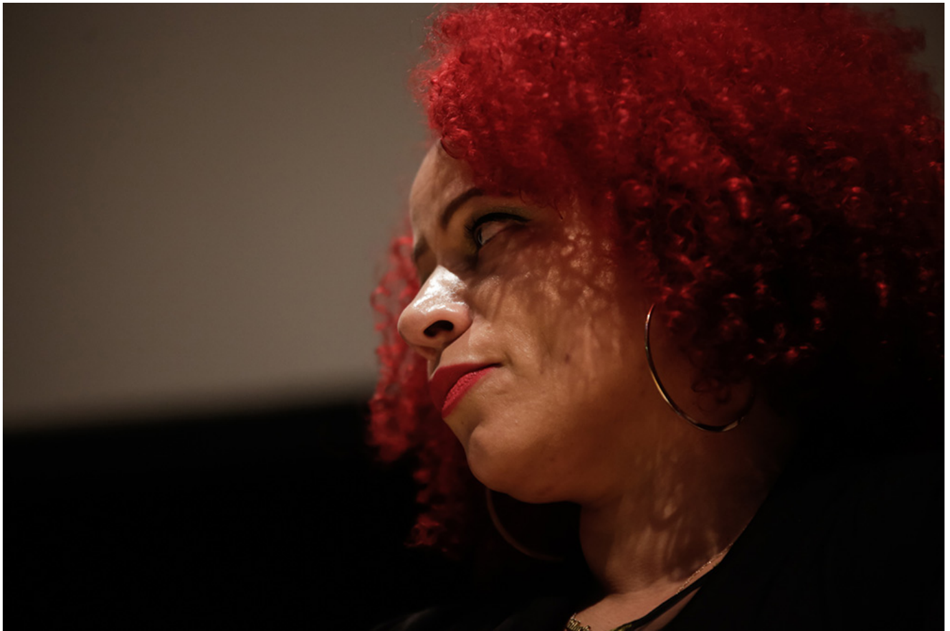
Nikole Hannah-Jones

The question for me provokes reflection, first, in a personal way on very basic realities that still are part of U.S. culture. I know that the presumptions that are packed into my understanding of how I will be perceived in countless situations and what I can take for granted day to day are not the same for my Black neighbors down the hall or in units above and below me in the condominium building where I live.