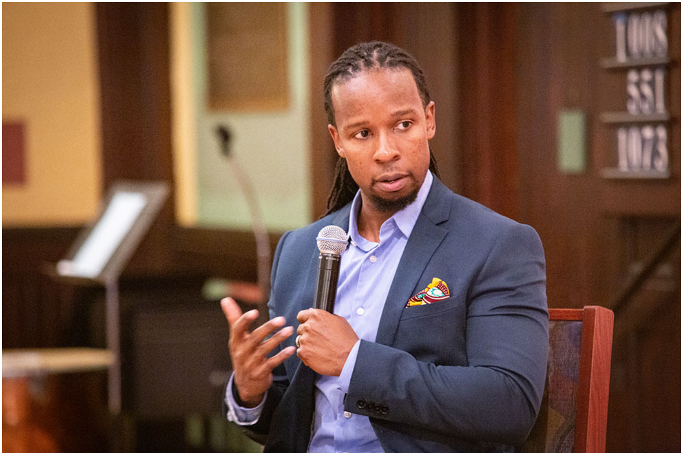
Ibram X. Kendi

In that personal instance, it might seem a bizarre declaration given the chaos and incompetence that followed him into the White House. In a much broader way, however, Ibram X. Kendi argues in the 1619 book that Obama "became" the version of "an American history popularly written as the story of incremental and steady racial progress."