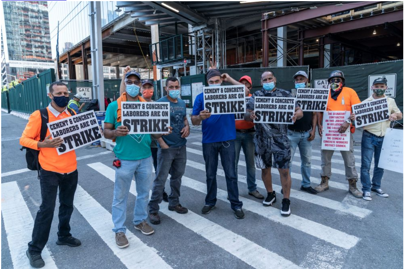
Union members in New York City hold a strike July 2, 2020.