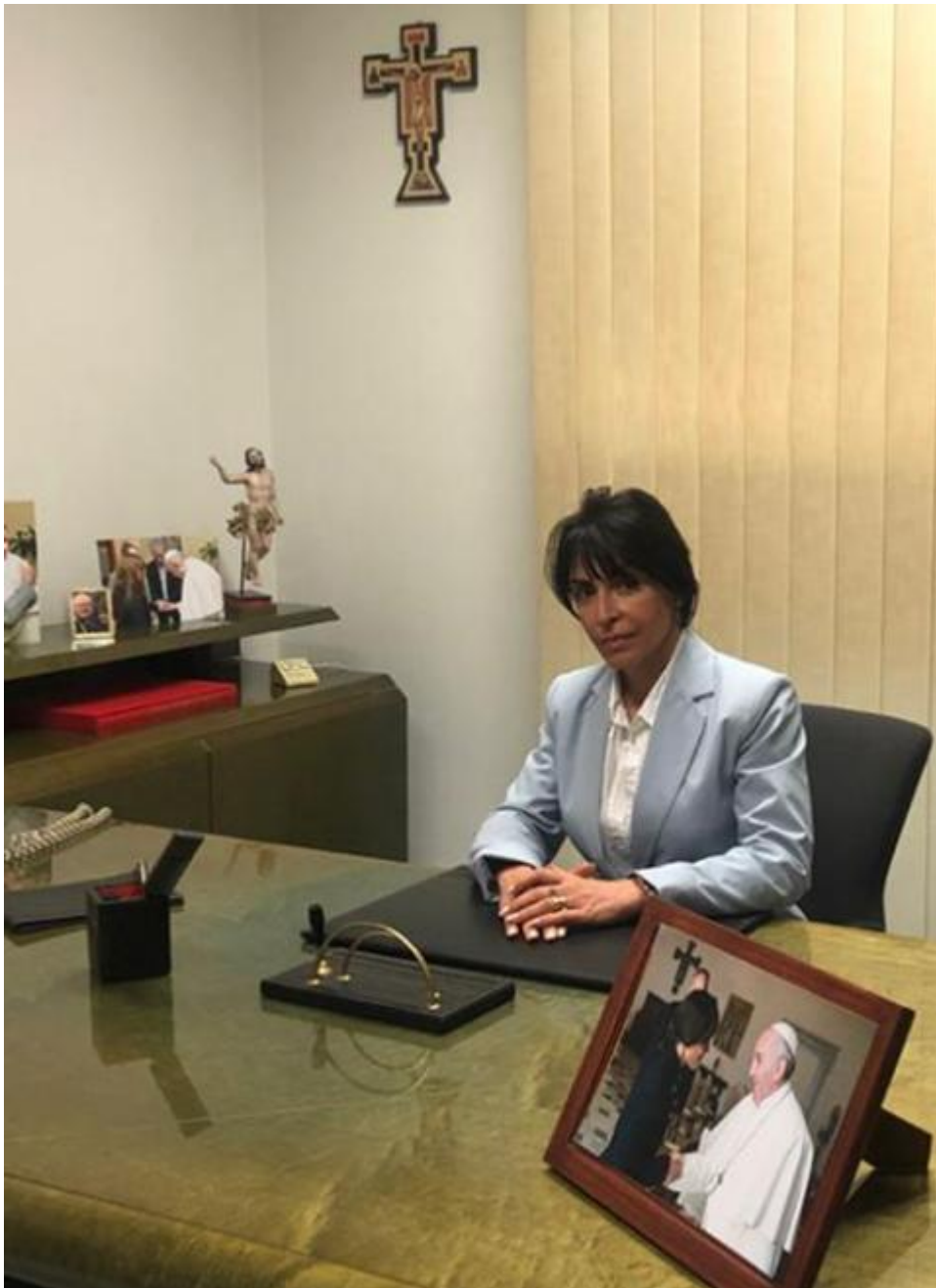
Emilce Cuda in her office at the Vatican