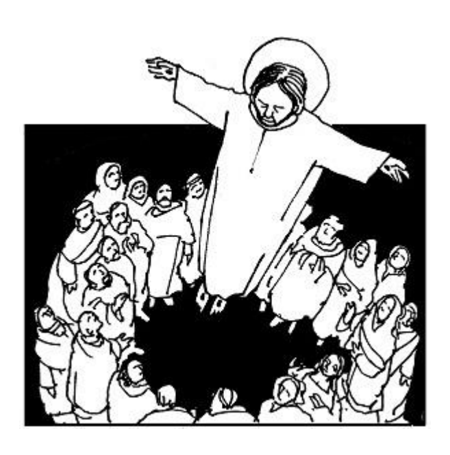
"Stay in the city until you are clothed in power" (Luke 24:45).