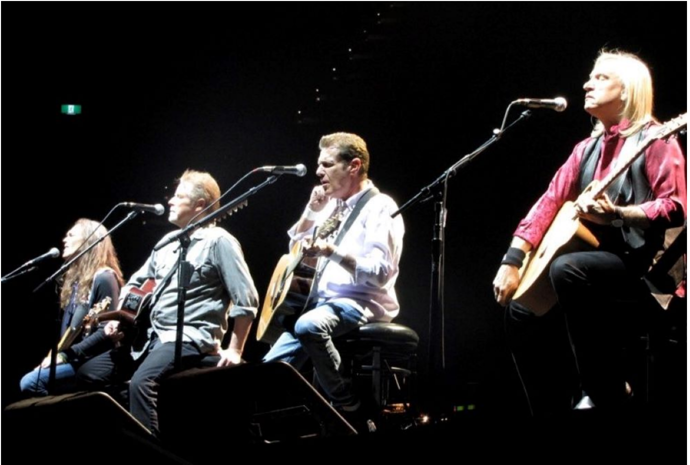
Eagles in concert Dec. 17, 2010, at Rod Laver Arena in Melbourne, Australia