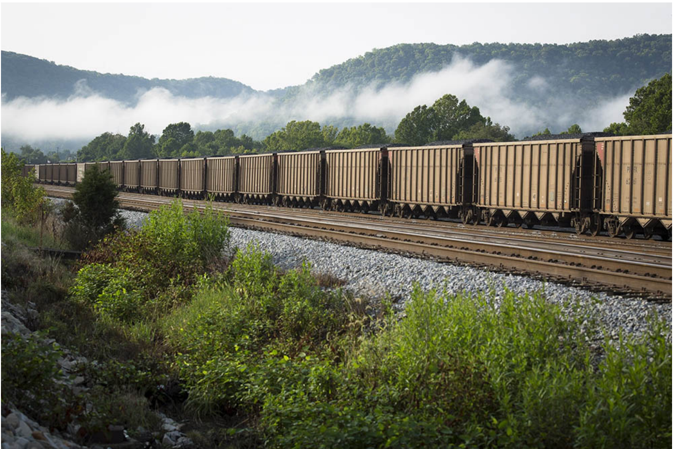
A train carries coal near Ravenna, Kentucky, in 2014.

"Make no mistake, the Supreme Court's ruling today risks the lives of thousands of people by limiting the ability of the U.S. government to regulate carbon pollution from power plants. It prioritizes polluters, especially the coal industry, over people," she said in a statement.