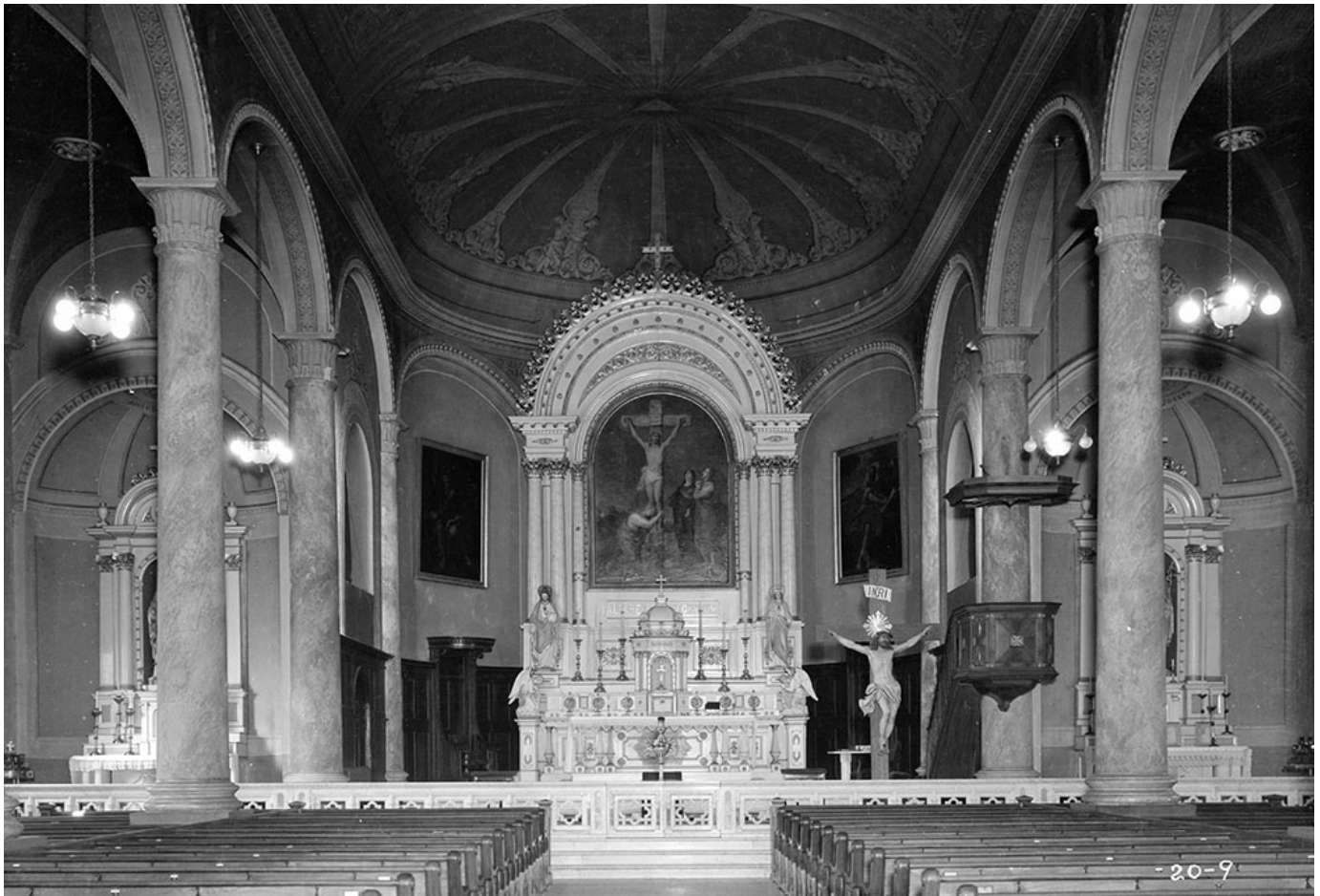
The interior of the Proto-Cathedral of St. Joseph in Bardstown, Kentucky, photographed in 1934

Rudd would later recall that he was baptized "at the same font where all the rest, white and black were baptized without discrimination except as who got there first. At confession all knelt in whatever order they came and waited their turn to relieve their sin burden."