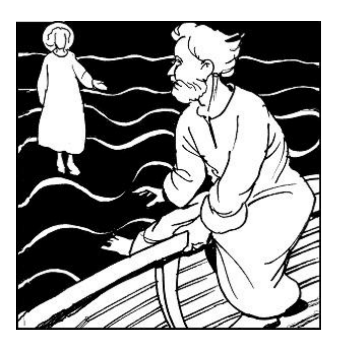
"Lord, if it is you, command me to come to you on the water" (Matt 14:30).