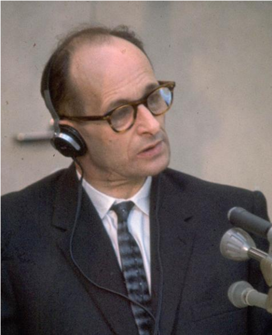
Adolf Eichmann on trial in Jerusalem in 1961

He then reflects on what the philosopher Hannah Arendt calls the "banality of evil" in her own reporting on and analysis of the Eichmann trial in her 1963 book Eichmann in Jerusalem .