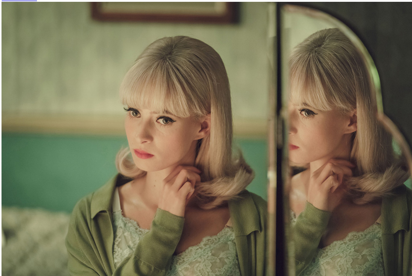
Vivien Epstein in the Masterpiece series "Ridley Road"