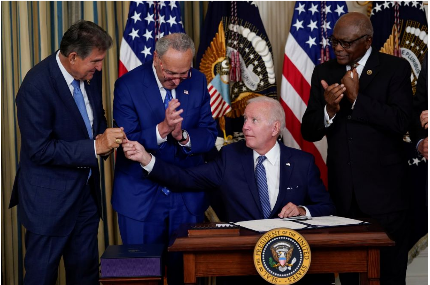
President Joe Biden hands the pen he used to sign the Democrats' landmark climate change and health care bill to Sen. Joe Manchin, D-W.Va., in the State Dining Room of the White House in Washington, Aug. 16.