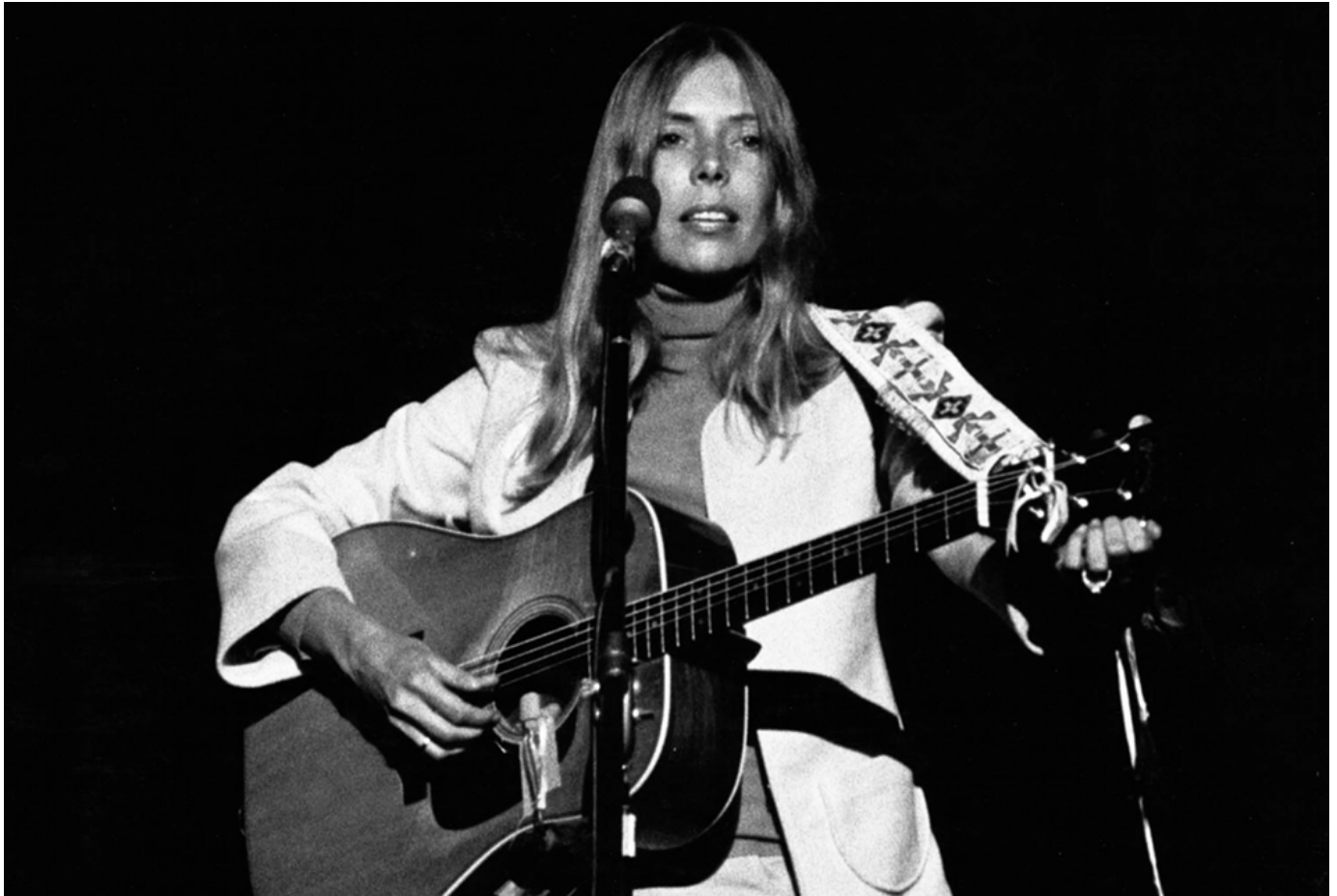
Joni Mitchell in concert at Universal Amphitheater in 1974