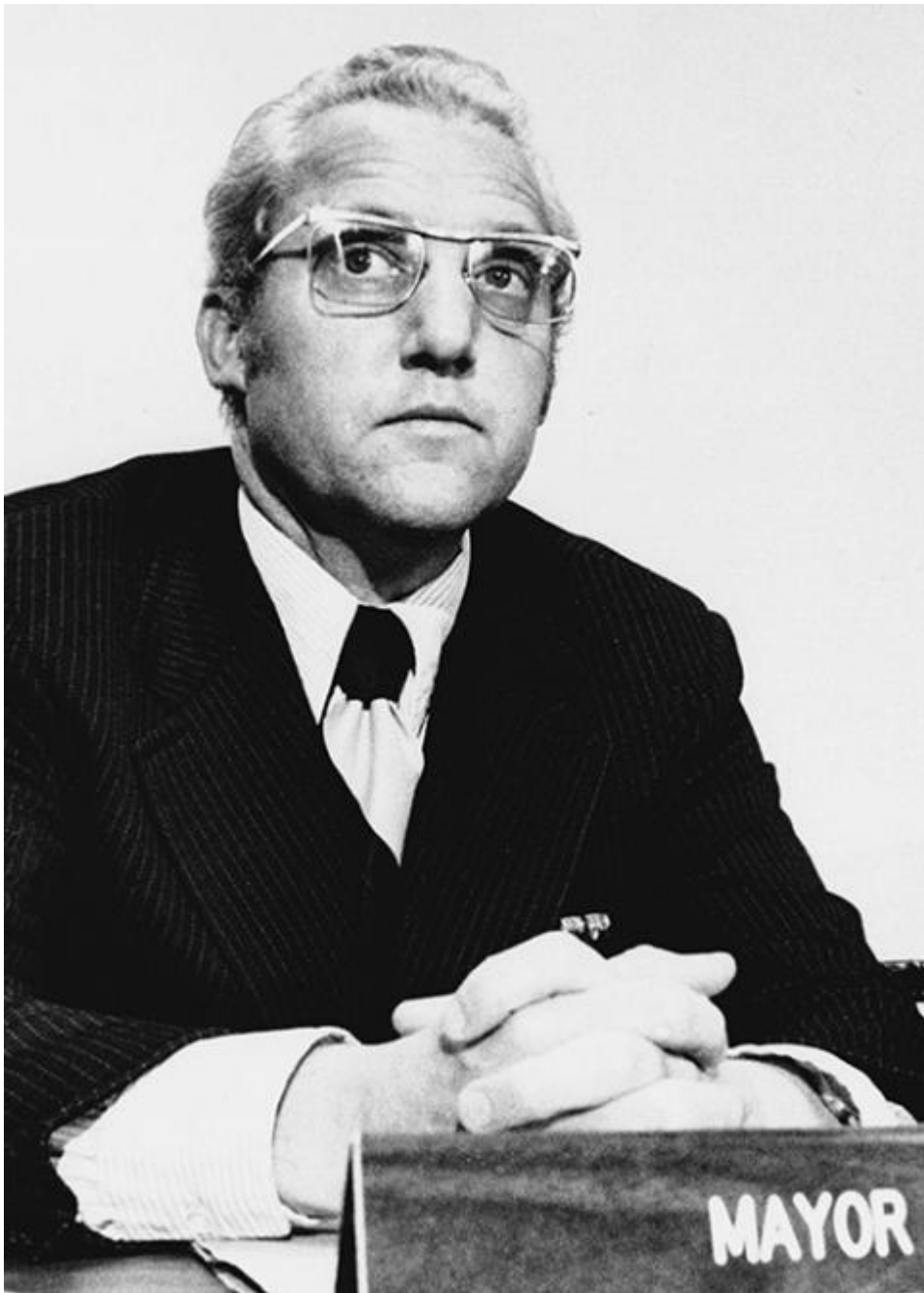
New Orleans Mayor Moon Landrieu on March 27, 1973, at a news conference in Washington, D.C., on the impact of the federal budget on the nation's cities