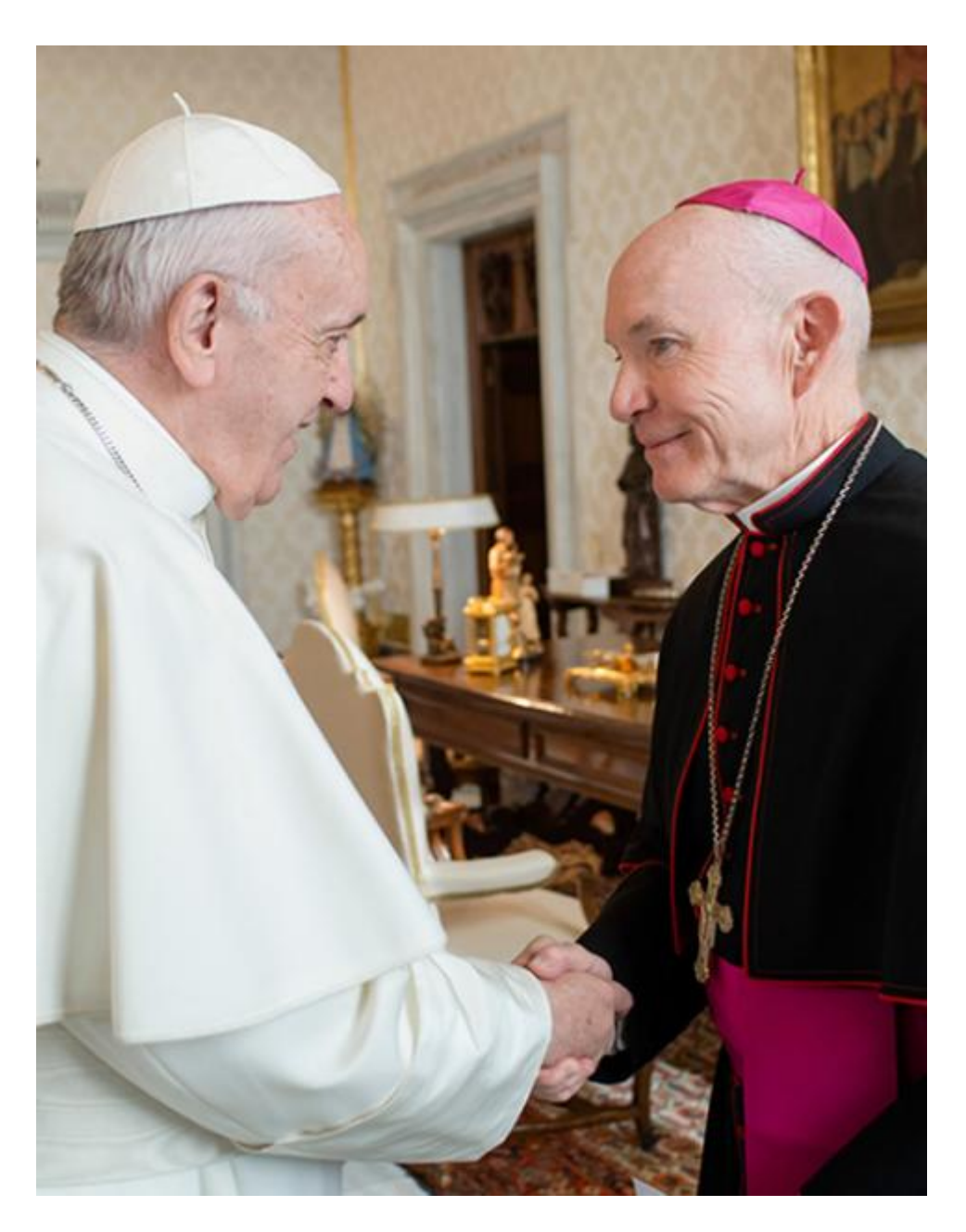
Pope Francis greets Archbishop George Lucas of Omaha, Nebraska, at the Vatican Jan. 16, 2020.

Francis' distinction between same-sex marriage and same-sex civil unions sheds an entirely new light on ENDA and the Equality Act, and should be reflected in the policy. His support of <u>legal protections for same-sex civil unions</u> makes an important distinction between civil law and church doctrine, prioritizes Catholic social over sexual doctrine, recognizes that LGBTQ+ people are discriminated against and need legal protection, and calls the church to practice respect, compassion and hospitality toward all people, including LGBTQ+ people.