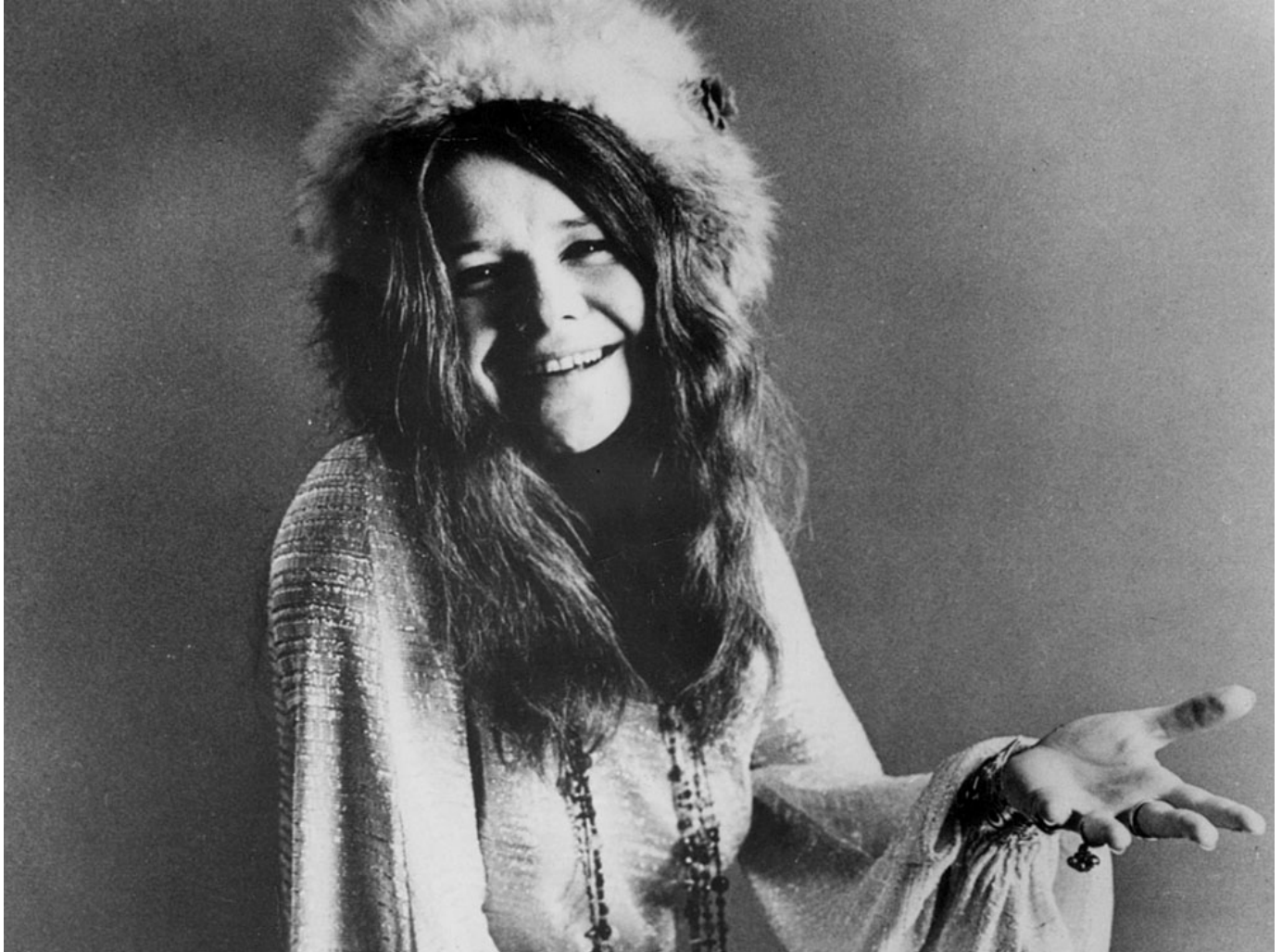
A 1970 publicity photo of Janis Joplin