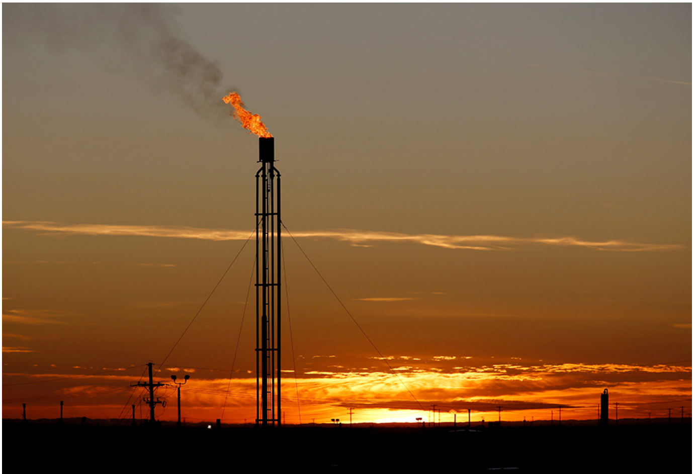
A flare burns excess natural gas in the Permian Basin in Loving County, Texas, in 2019.

In the letter, faith groups also expressed concerns about hydrogen and nuclear energy and further investments in fossil fuel infrastructure, particularly requiring the federal government to auction oil and gas leases in the Gulf of Mexico and Alaska.