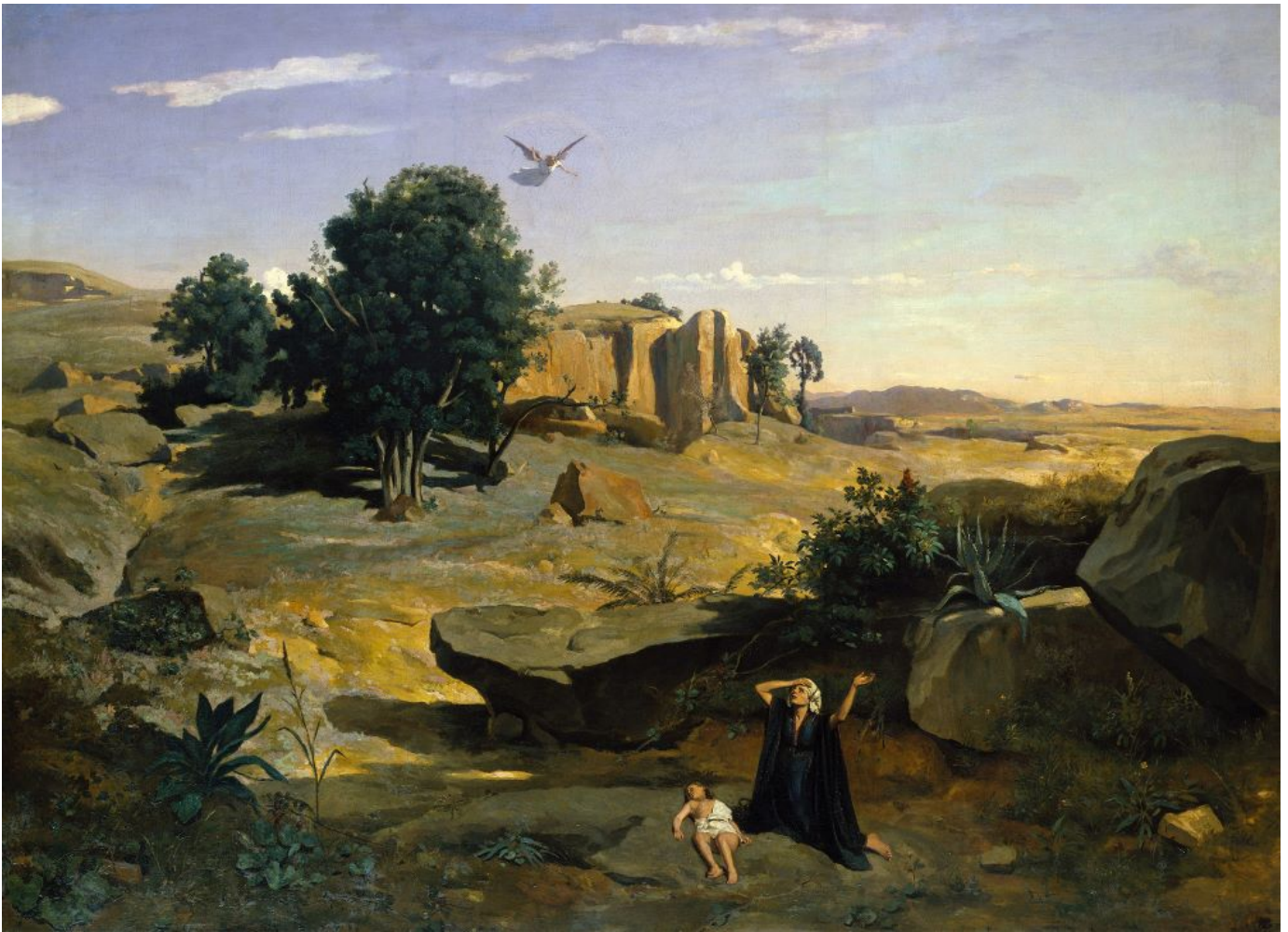
"Hagar in the Wilderness" (1835) by Jean-Baptiste-Camille Corot