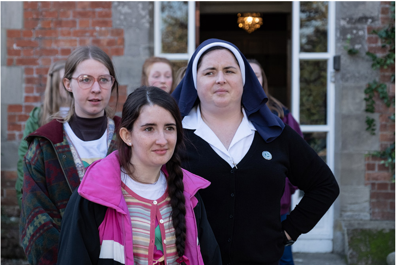
Siobhán McSweeney, right, as Sister Michael in "Derry Girls"

To American viewers, much of this Catholic-poking might seem offensive or profane, especially given the number of F-bombs the characters regularly drop. There are outrageous plots involving weeping statues and Grandpa Joe picking up a girlfriend at Stations of the Cross. (Erin: "Which station?" Grandpa Joe: "Jesus falls a second time.")