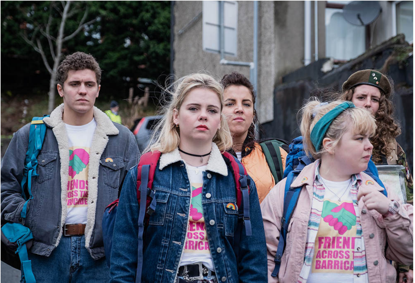
From left: Dylan Llewellyn as James, Saoirse-Monica Jackson as Erin, Jamie-Lee O'Donnell as Michelle, Nicola Coughlan as Clare, and Louisa Harland as Orla in "Derry Girls"