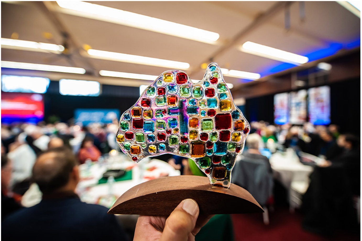
A person in Sydney holds a memento of the Plenary Council of Australia July 4.

A second thing is that you need the right kind of leadership at the right time. As I look back across our Plenary Council journey, I can see how at different times the Spirit raised up different leaders — not all of them ordained — to meet the needs of the moment.