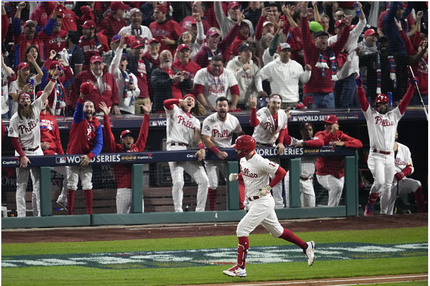
Philadelphia Phillies' Rhys Hoskins rounds the bases after a two-run home run during the fifth inning in Game 3 of baseball's World Series between the Houston Astros and the Philadelphia Phillies on Nov. 1 in Philadelphia.