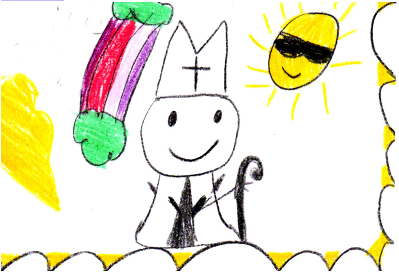
Artwork from a letter by a Robb Elementary student who wrote to Pope Francis