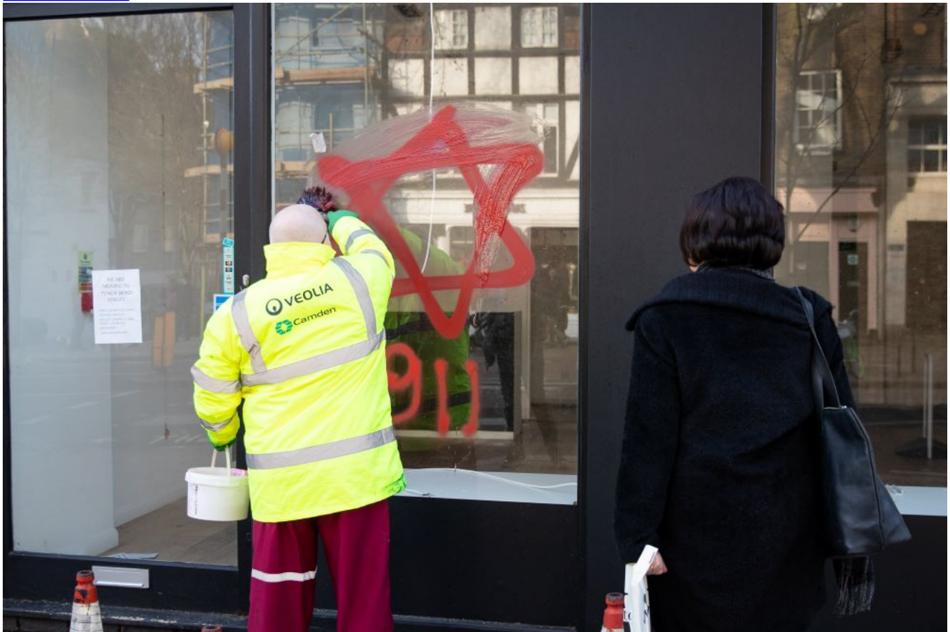
A worker removes antisemitic graffiti on a shop window in the Belsize Park neighborhood of London Dec. 29, 2019.