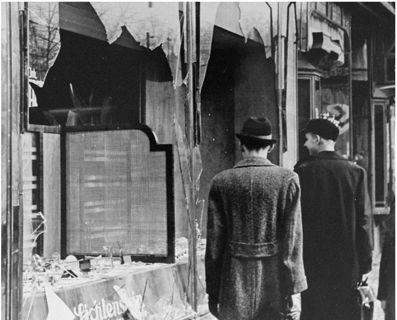
Germans pass the broken shop window of a Jewish-owned business in Berlin that was destroyed Nov. 9-10, 1938, during Kristallnacht, or the "Night of Broken Glass,"

But as much as they misunderstand medieval civilization and the role of liturgy in culture, they are, unfortunately, correct about the antisemitism of medieval Europe. The problem is that instead of viewing medieval antisemitism with horror, as something for which the church should repent, they view it with approval, as something the church should reclaim.