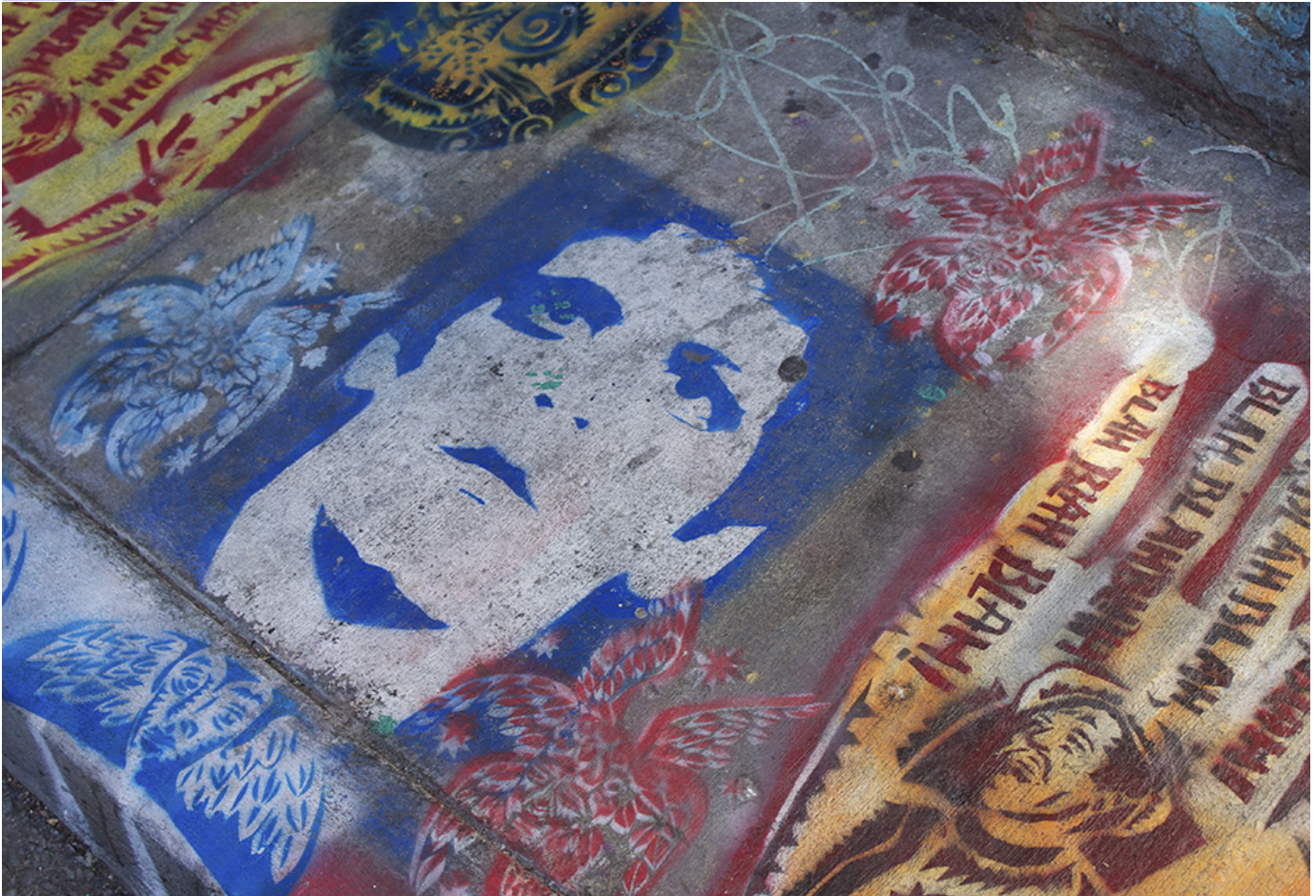
Street art with Lou Reed