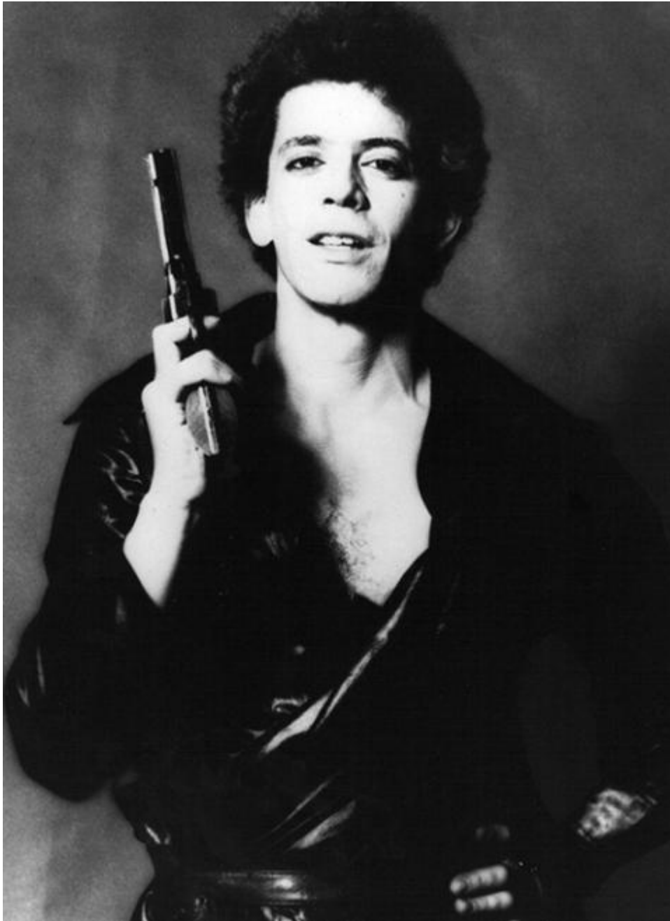
Lou Reed in 1977