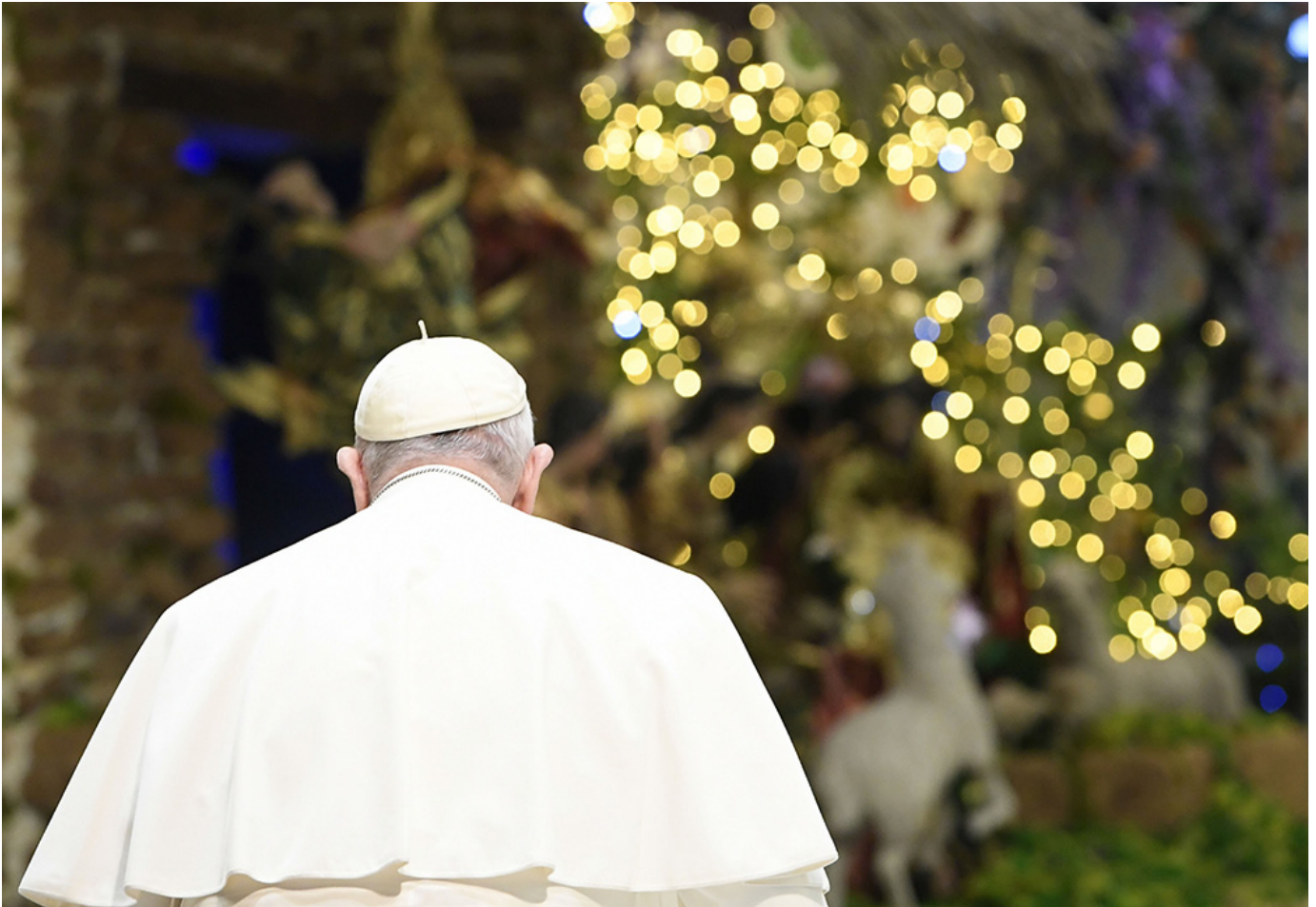
Pope Francis in the Paul VI hall at the Vatican Dec. 3, 2022