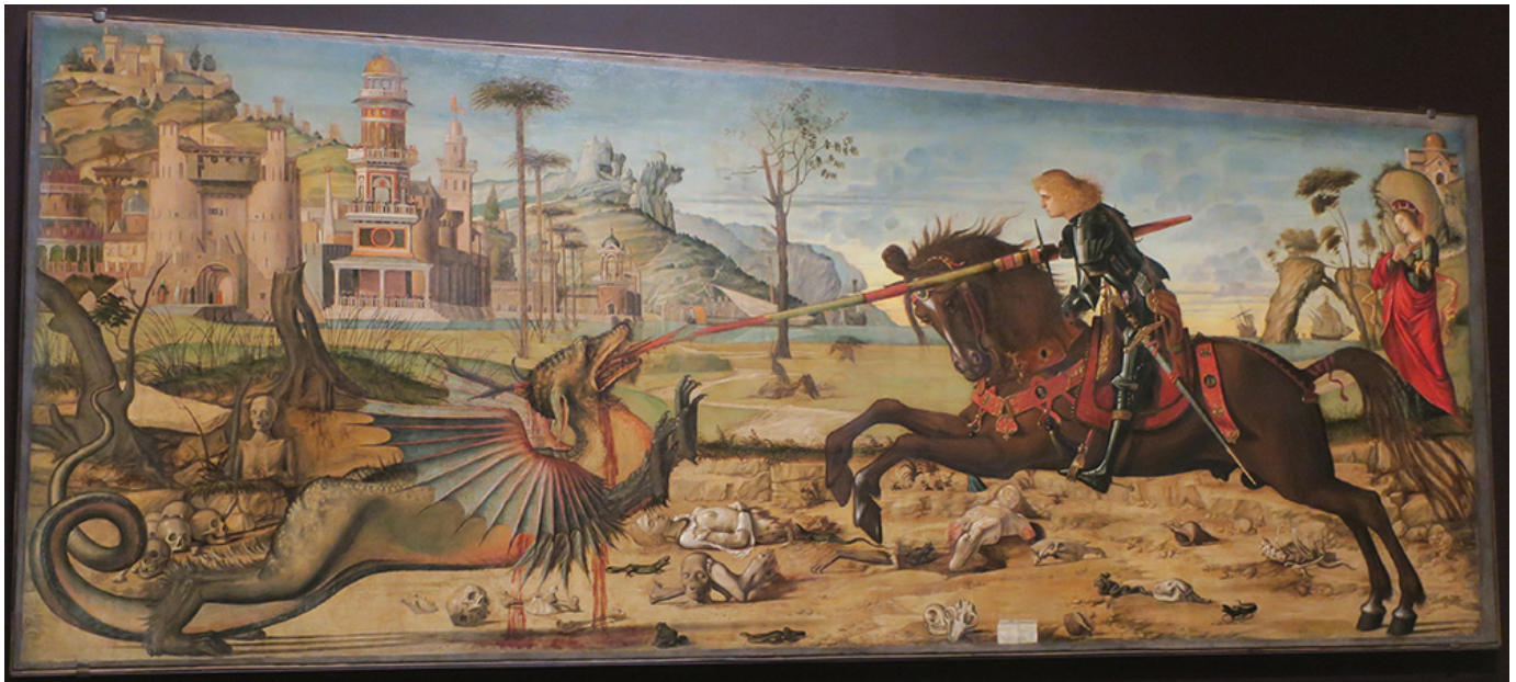
"St. George and the Dragon" (circa 1504-1507) by Vittore Carpaccio. Scuola Dalmata dei Santi Giorgio e Trifone, Venice.

Beholding the wall-sized picture in person, it is easy to imagine Carpaccio's contemporaries might have considered it a kind of documentary.