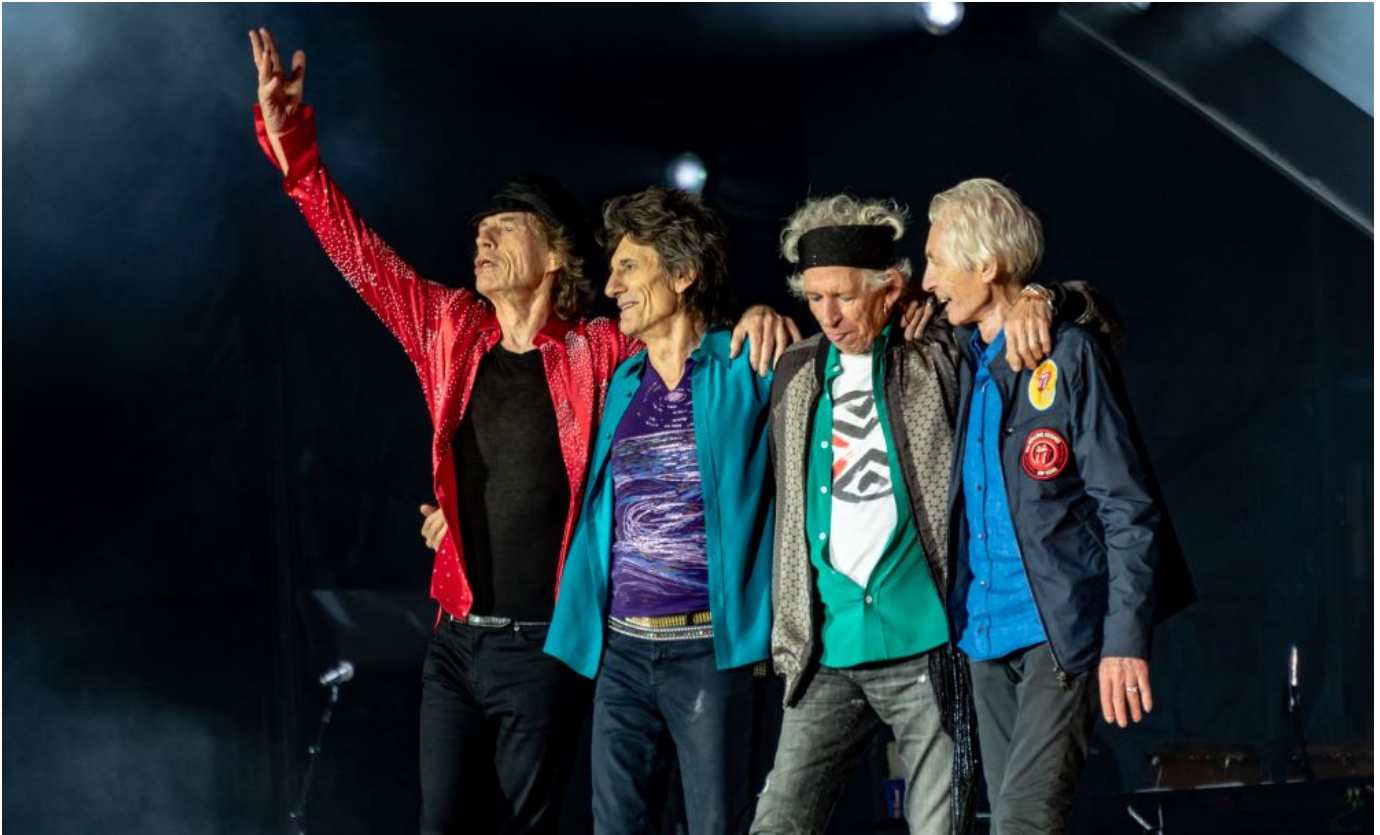
The Rolling Stones, (from left) Mick Jagger, Ronnie Wood, Keith Richards and Charlie Watts, bow post-show in London 2018.

Isn't all art? (A reflection of the moment)