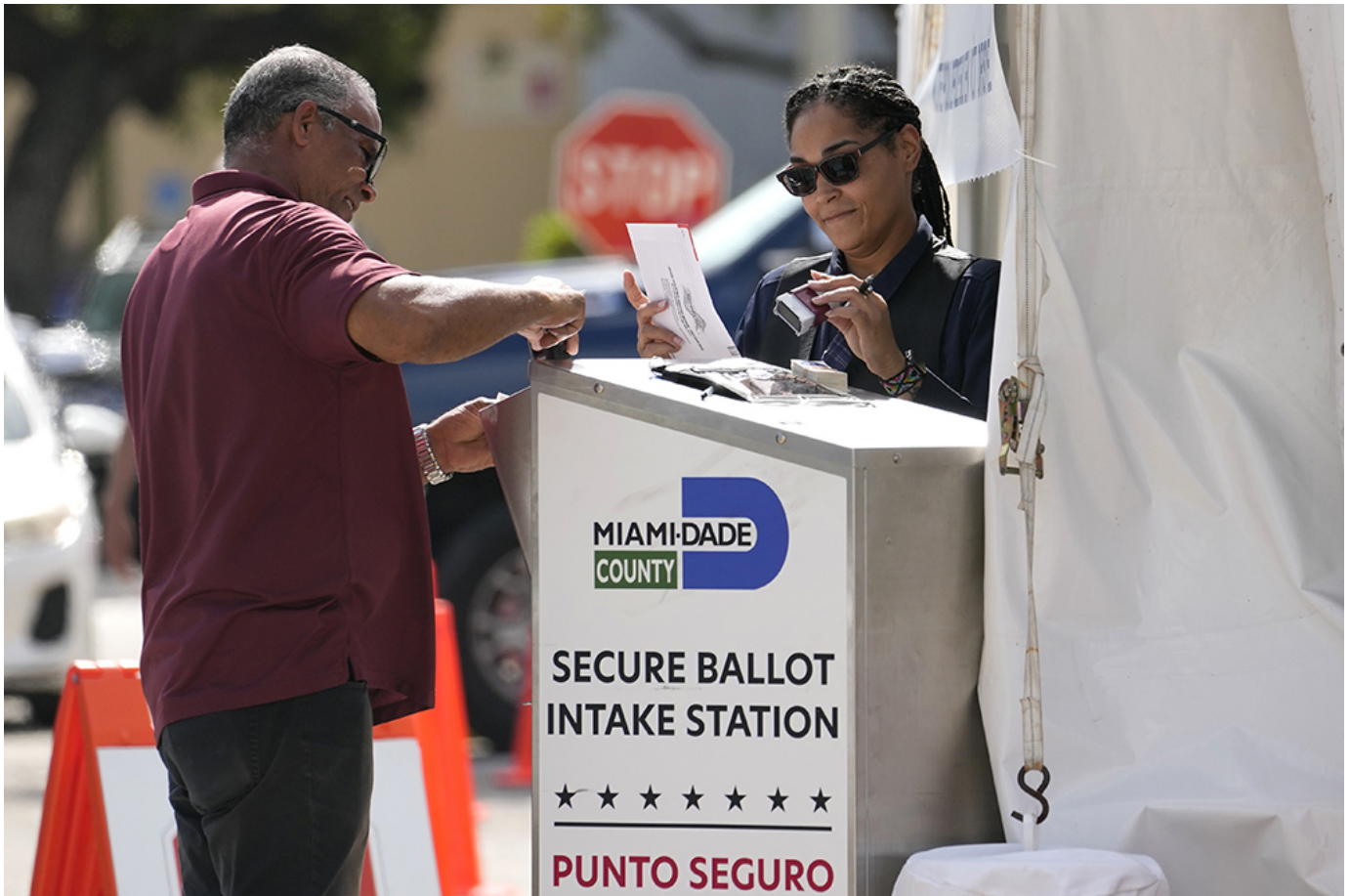
Employees process vote-by-mail ballots for the midterm election at the Miami-Dade County Elections Department Nov. 8, 2022, in Miami.

What drives the discrepancies that exist between exit polling data and the Equis and UCLA type of studies are that the former tends to rely on samples that do not contain sufficient Latino voter responses, making the data wholly unreliable, while the latter studies the actual election results, with the use of ethnic modeling data from state voter files.