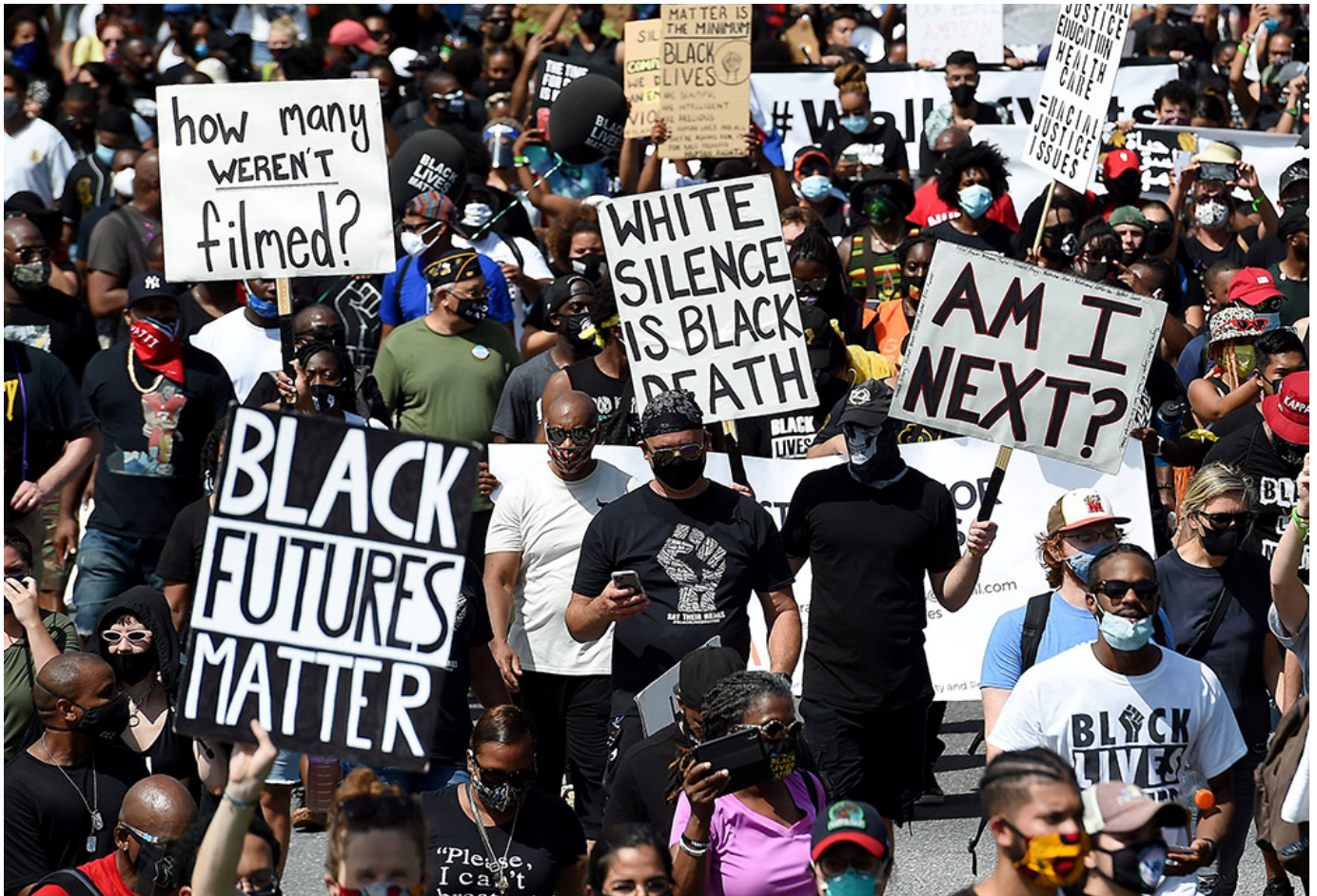
People hold placards in Washington Aug. 28, 2020, during the "Get Your Knee Off Our Necks" Commitment March on Washington 2020 in support of racial justice.

I recently completed a class on "The Distinctive Gifts of Black Catholic Spirituality" at Loyola Marymount University. I was struck by two realities. First, the participants' collective experience with racism and racial indifference in their parishes and dioceses, and second, their continued commitment to remain Catholic. Some consider it a miracle that any Black person is faithful to a church with historical and continued racial indifference, ignorance, and, at times, hostility. The writer of the letter to James told us two millennia ago, "these things ought not to be so" ( James 3:10 ).