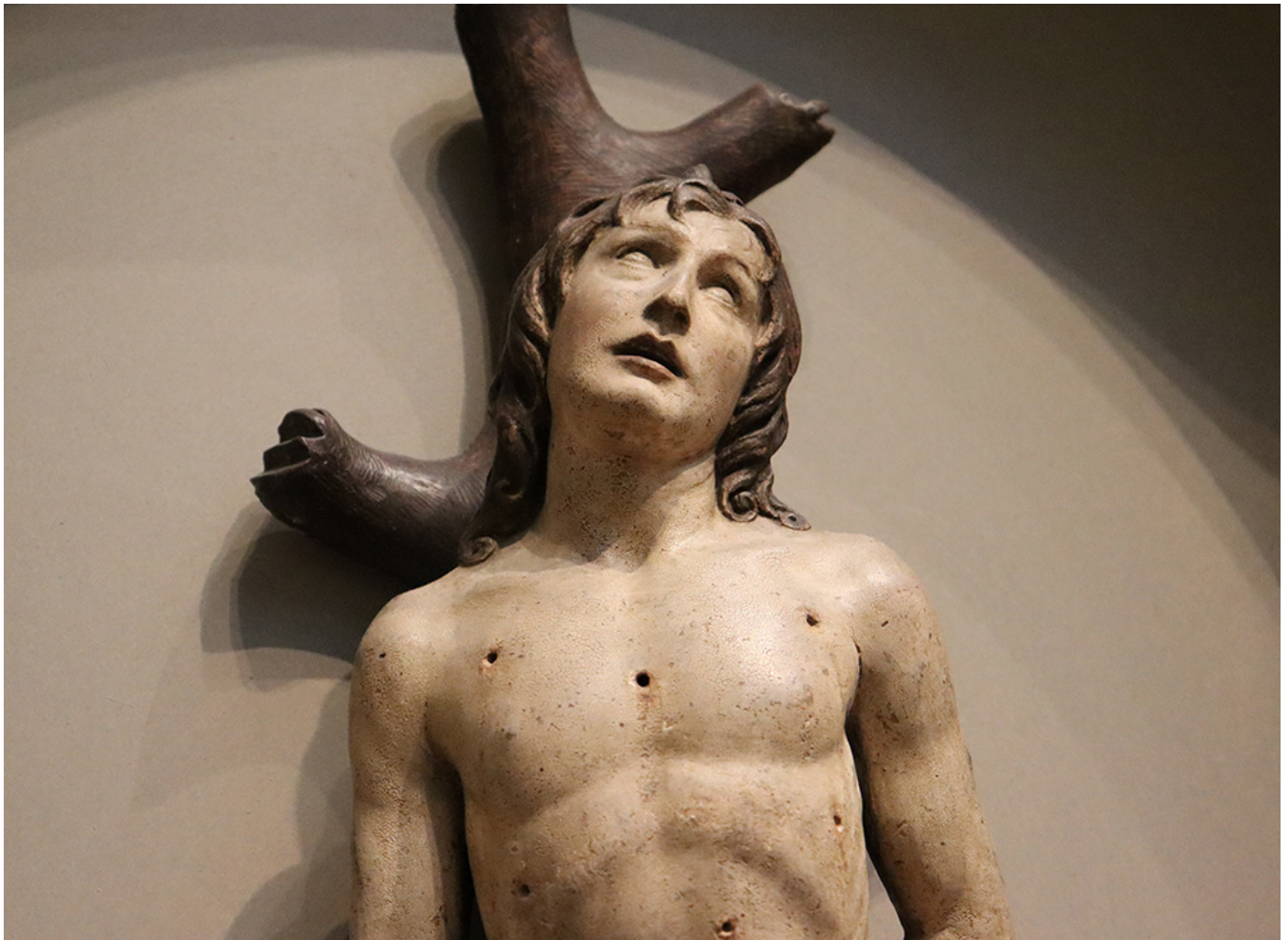
"St. Sebastian," 15th-century painted terra cotta sculpture by Matteo Civitali at the National Gallery of Art in Washington, D.C.

Yet invention as praxis is not new — but maybe even central — to our Catholic spiritual practice regarding venerating the saints. Looking at Catholic history as a whole, we can see that many stories of the saints are also stories of inventions of the past. These hagiographies are invented not for the sake of falsity, but out of longing for a spiritual ancestor who shares in their faith and their struggles for survival.