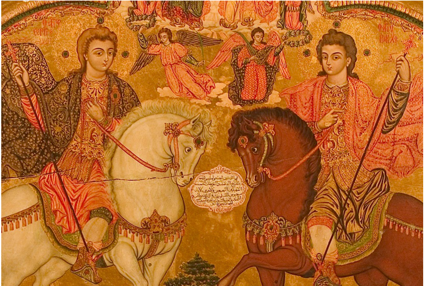
An icon of Sts. Sergius and Bacchus at Mar Sarkis monastery in Maaloula, Syria