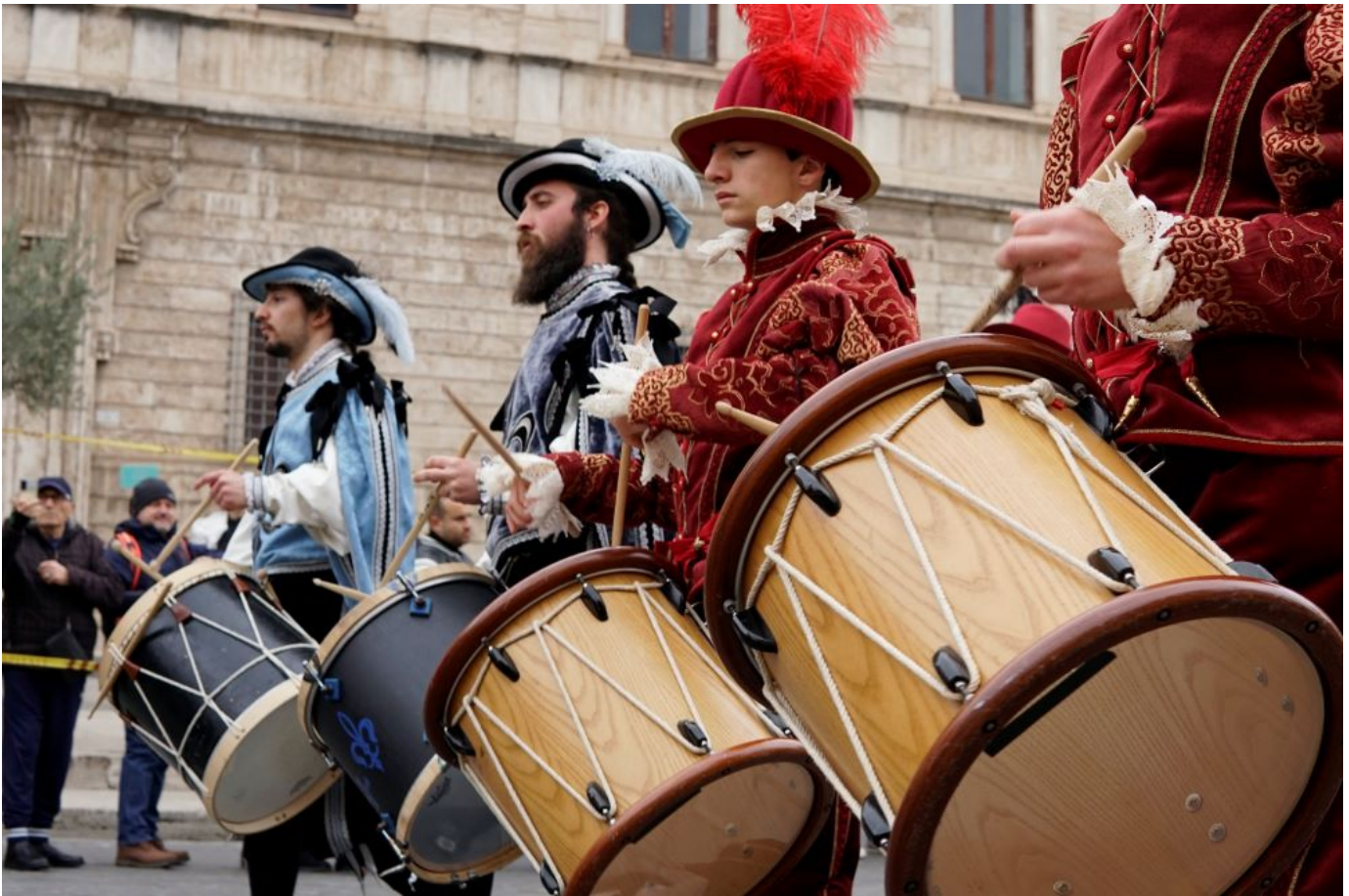
Drummers participate in a parade marking the feast of the Epiphany in Rome near the Vatican Jan. 6.