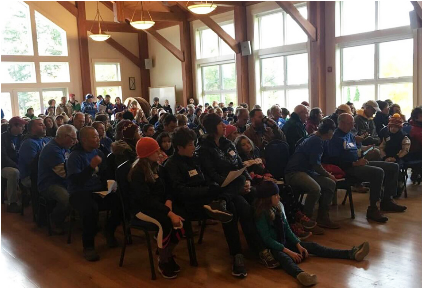
Parishioners of Holy Family-St. Lawrence Parish in Essex Junction, Vermont, gather in the parish hall for Serve Your Neighbor Day in October 2018.

"What are the resources that we have to put at the disposition of that mission?" he asked. Responding, "In this case, one of them was this building as a resource."