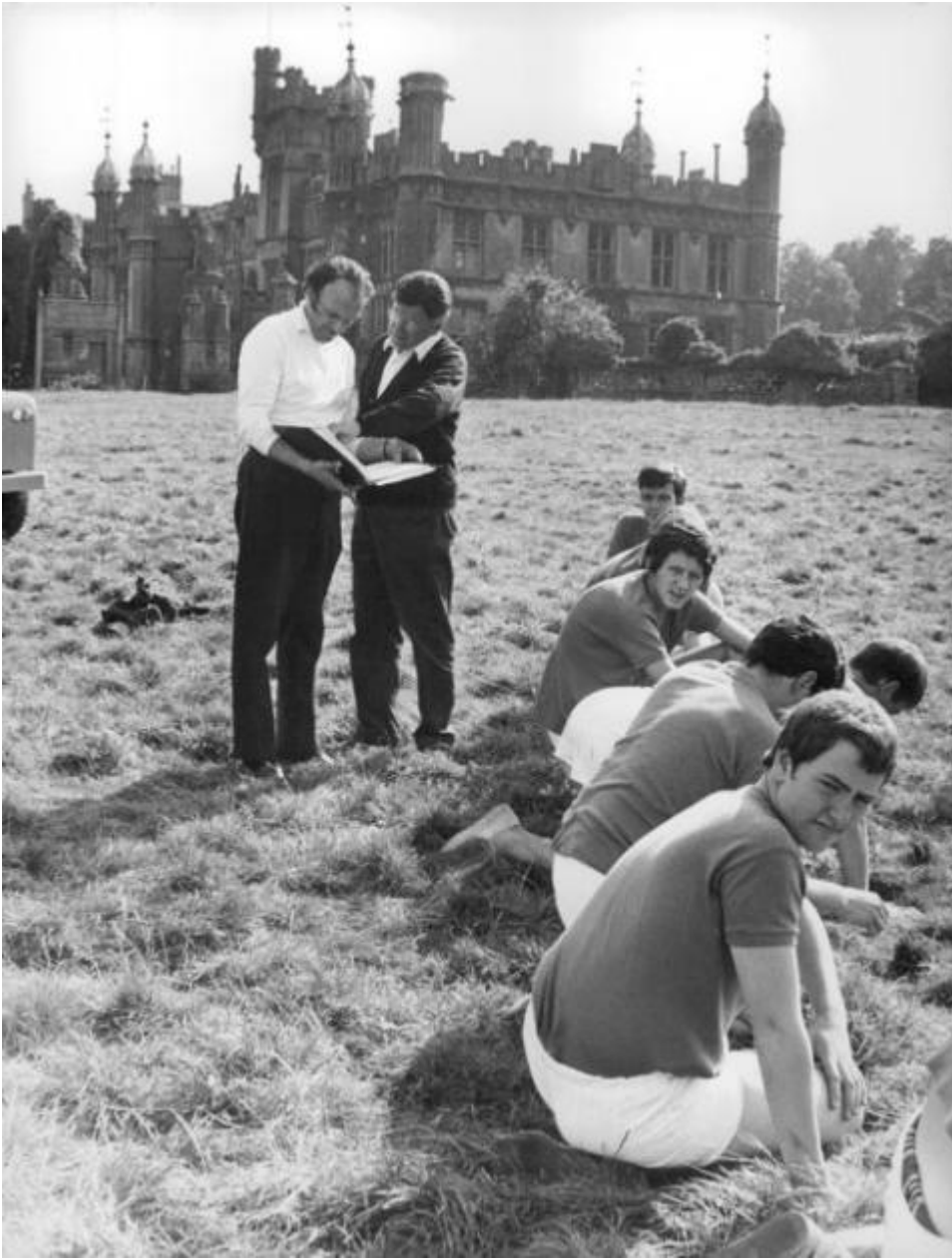
Pictured is a scene from the 1967 British comedy "Decline and Fall of a Birdwatcher" an adaption of Evelyn Waugh's first novel, "Decline and Fall," published in 1928.

cuts away at everything that veils sin. In his 1934 novel A Handful of Dust , that veil is made of fame, privilege, power, class and socialite culture. Waugh tears the veil away in a scene that can't be forgotten. A mother who pursues a romantic affair with an awful man called John — who bears the same name as her young son — receives news that "John" had suffered a terrible accident. As it slowly dawns on her that the victim is her little boy and not her lover, her initial reaction is to thank God in relief — before bursting into tears. The horrible scene is compelling because it's so authentically human.