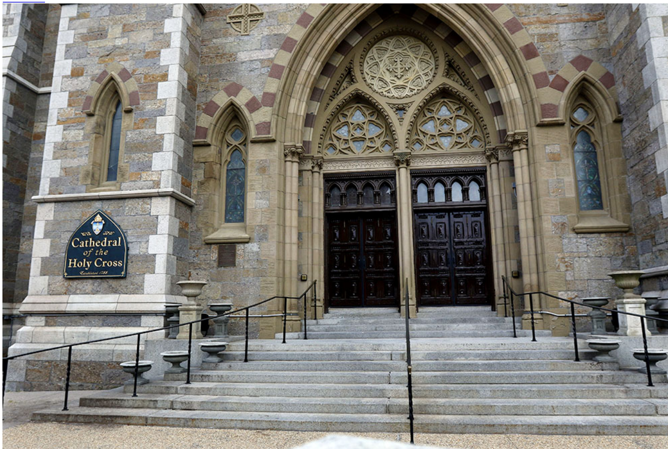
The Cathedral of the Holy Cross in the Boston Archdiocese