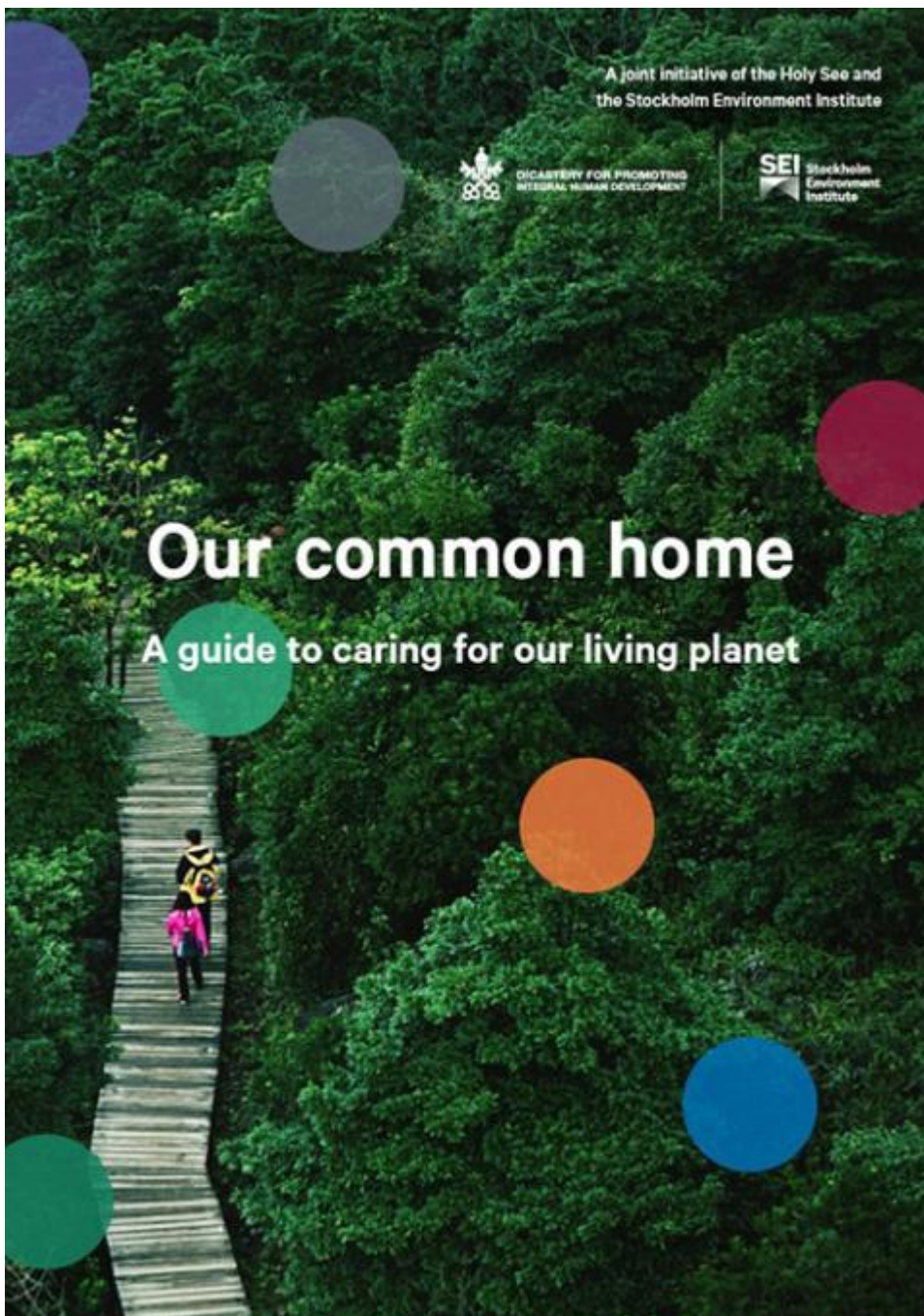
The cover of "Our Common Home: A Guide to Caring for Our Living Planet"

For each, it offers a summary of the topic paired with a passage from " Laudato Si' , on Care for Our Common Home" — Francis' 2015 encyclical on ecology — along with brief descriptions of what is required to address the problem and suggested reflections and action steps for people to take.