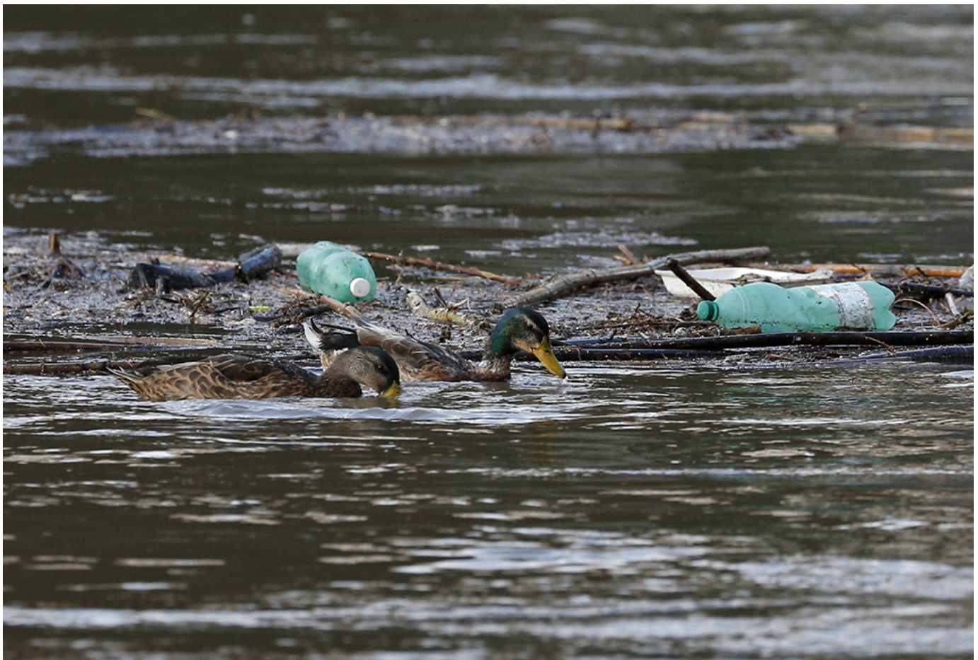
Ducks swim past plastic bottles and other debris floating on the Tiber River in Rome July 28, 2019. In his 2015 encyclical, "Laudato Si", on Care for Our Common Home,"

Added Czerny, "Current modes of economic development rely on the unsustainable burning of fossil fuels; the current market pushes harmful levels of consumption that pollute the environment with garbage as well as our souls and spirits with insatiable greed. But this wild license to consume is enjoyed by a shrinking minority of the global population that hoards power and wealth and ignores any sense of the genuine common good."