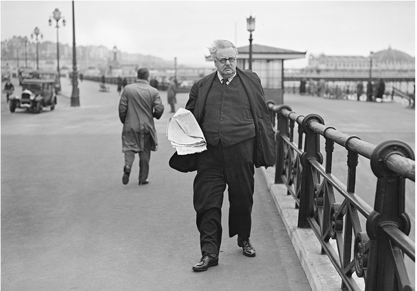
G.K. Chesterton takes a stroll in Brighton, England, on Oct. 30, 1935.