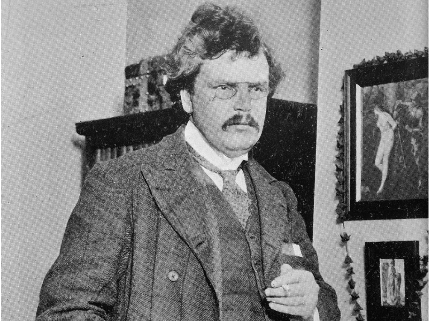
Catholic author G.K. Chesterton in an undated photo