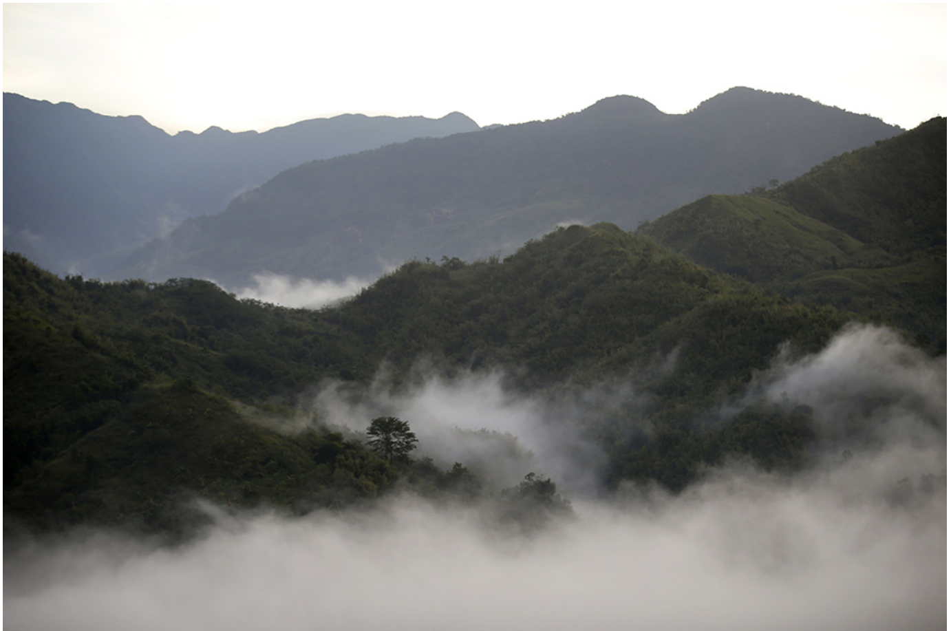
Clouds cover the Sierra Madre mountain range at sunrise as seen from Rodriguez township, Rizal province, Philippines.

The most widely known effort was the fight, led by Kalinga chief Macli-ing Dulag , against the proposed hydroelectric Chico River Dam in the Cordillera region. Dulag was gunned down by soldiers in his mountain home in 1980 and is now hailed as a hero by his people and many Filipinos. The dam did not push through.