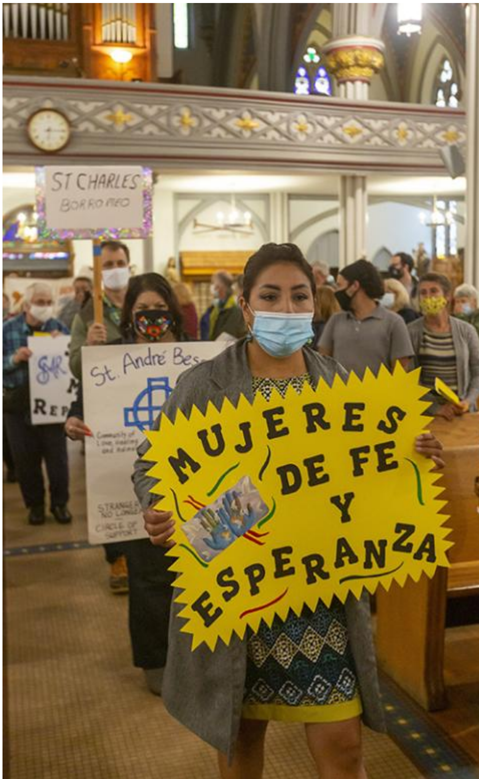
Advocates for immigrants process into Mass at Holy Trinity Catholic Church in Detroit Sept. 22, 2021.