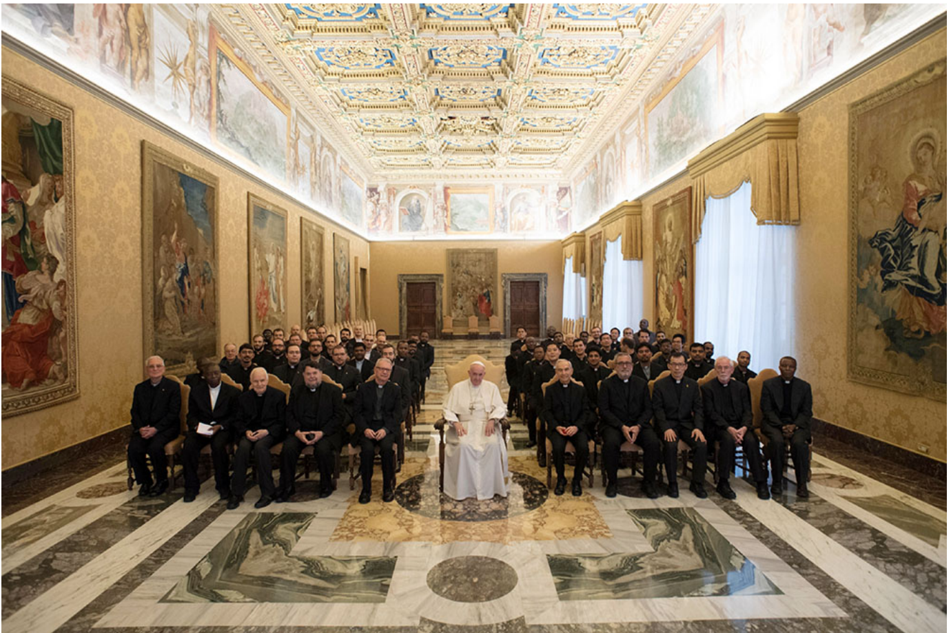
Pope Francis poses for a photo with faculty and staff of the Jesuits' International College of the Gesù in Rome during an audience at the Vatican Dec. 3, 2018.

For many Jesuits, having a member of their religious order elected pope was a bit of whiplash, given both the order's recent history in Rome, as well as Bergoglio's own history with the order.