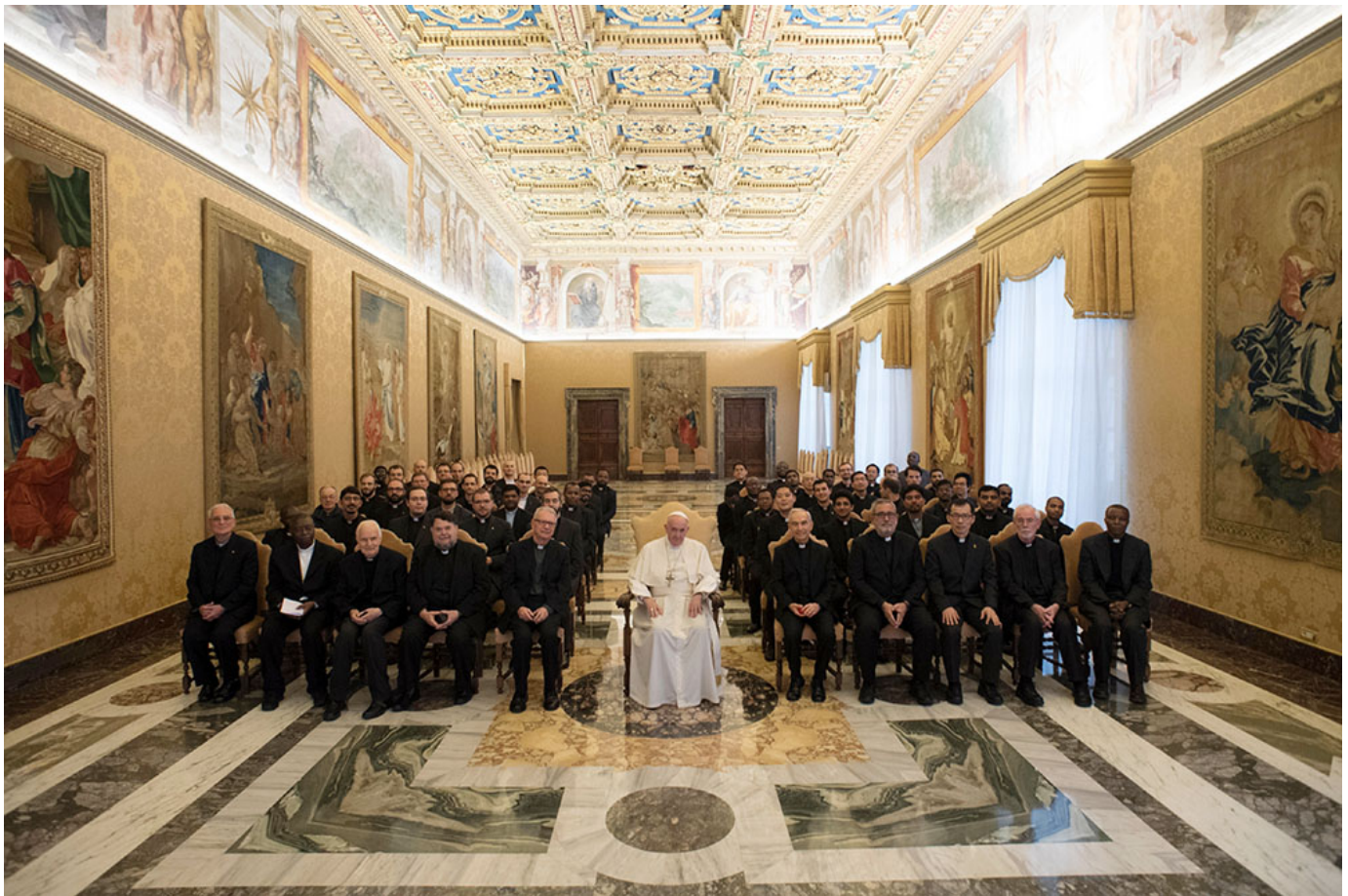
Pope Francis poses for a photo with faculty and staff of the Jesuits' International College of the Gesu 1 in Rome during an audience at the Vatican Dec. 3, 2018.

For many Jesuits, having a member of their religious order elected pope was a bit of whiplash, given both the order's recent history in Rome, as well as Bergoglio's own history with the order.