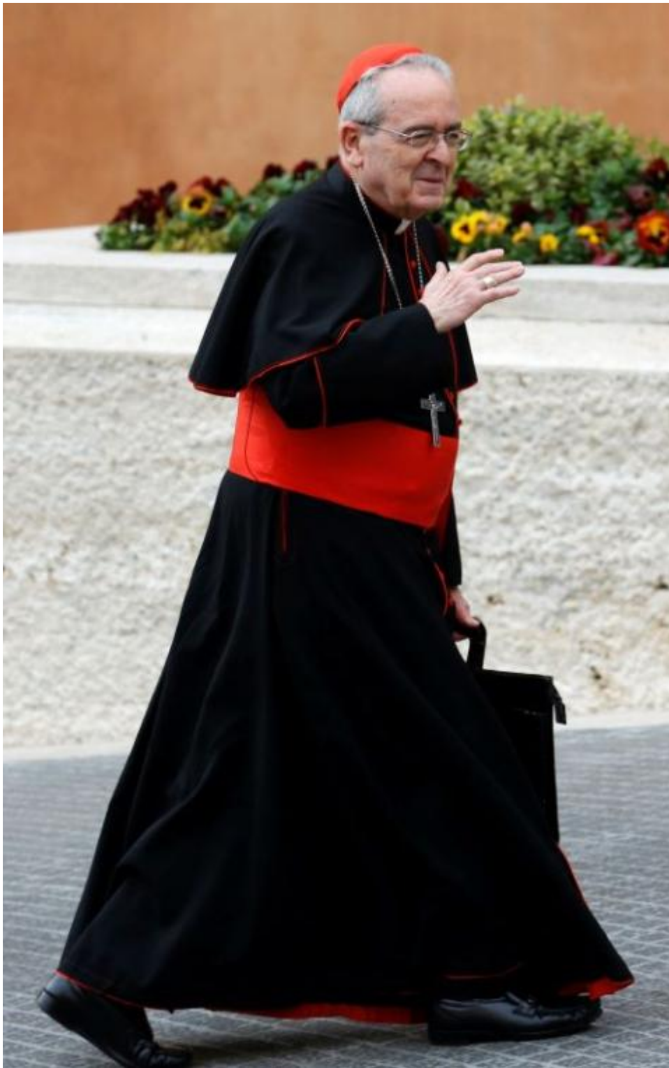
U.S. Cardinal Justin Rigali, retired archbishop of Philadelphia, waves as he arrives for a general congregation meeting at the Vatican March 5, 2013, ahead of the conclave that would elect Jorge Bergoglio pope.