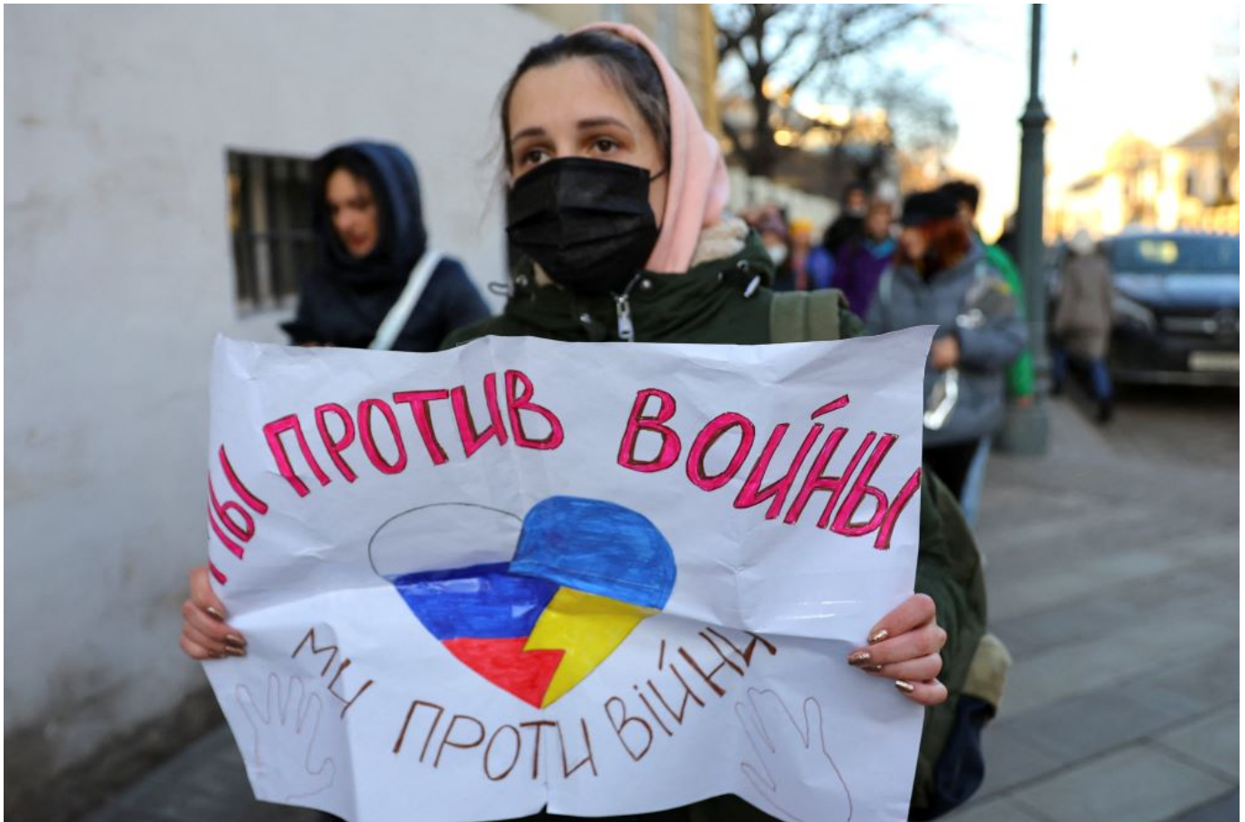
A young woman holds a sign that reads "We are against war" during a protest in Moscow Feb. 27, 2022, after Russia attacked Ukraine.

They would refuse to be part of any military, or follow a government law or decree that would require them to kill, torture, oppress and wage war.