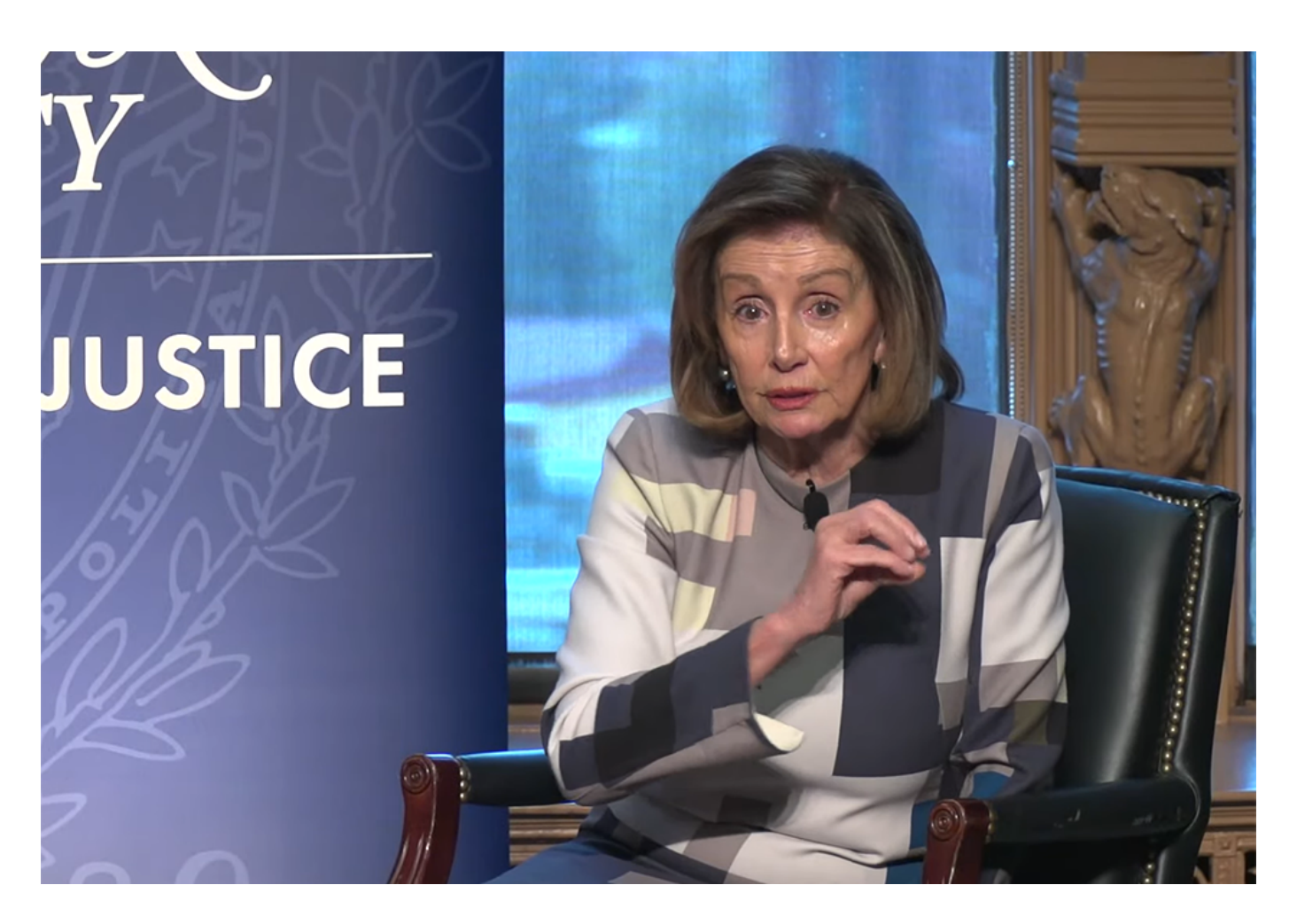
Former U.S. House Speaker Nancy Pelosi speaks March 23 at Georgetown University

Pelosi also criticized Cordileone's <u>role</u> in the 2008 passage of Proposition 8, a California ballot measure banning the recognition of same-sex marriages that technically <u>remains</u> in that state's constitution even after the U.S. Supreme Court required states to recognize same-sex marriages in its landmark 2015 case Obergefell v. Hodges .