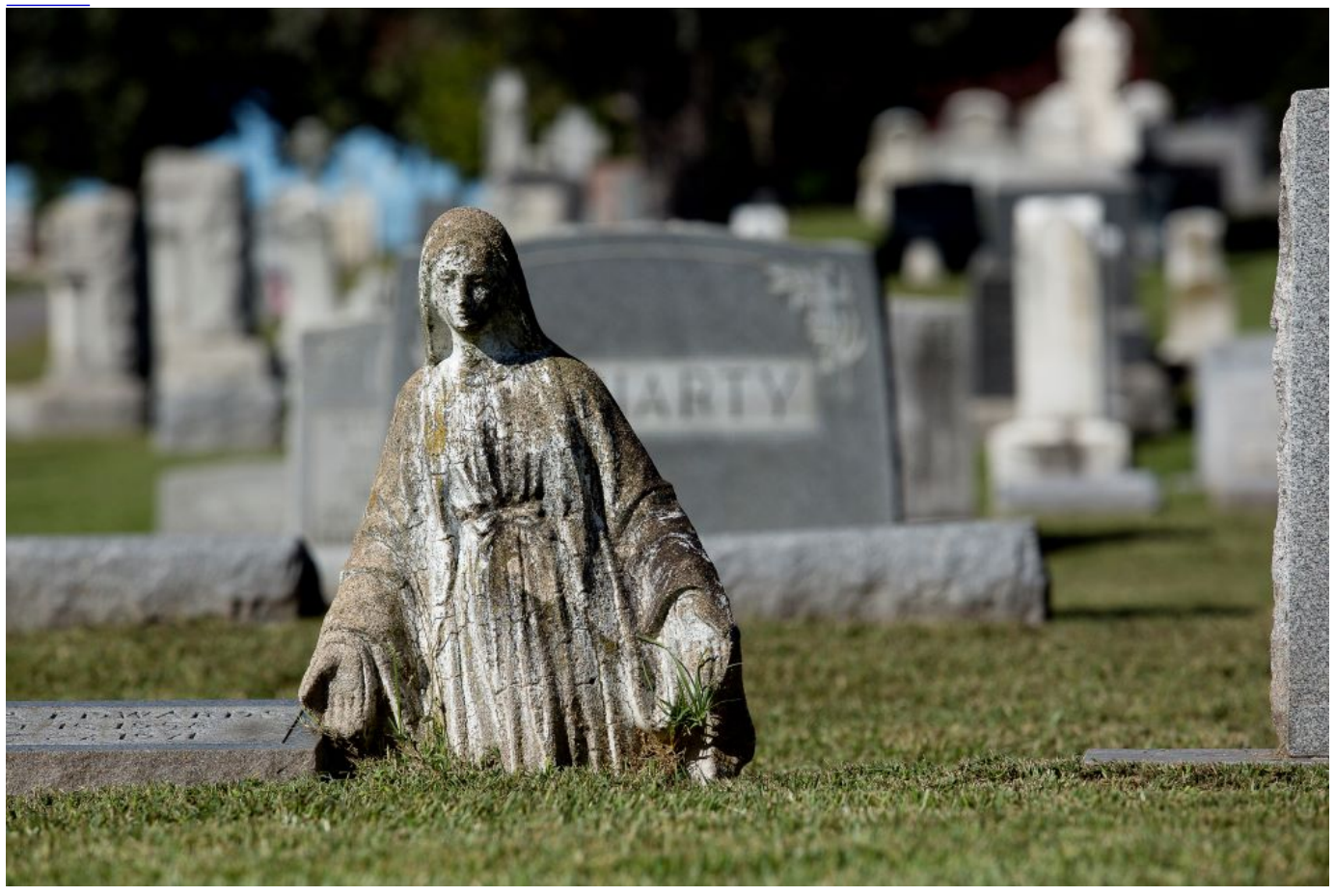
St. Mary Parish's cemetery in Alexandria, Va., is seen in this 2017 file photo.