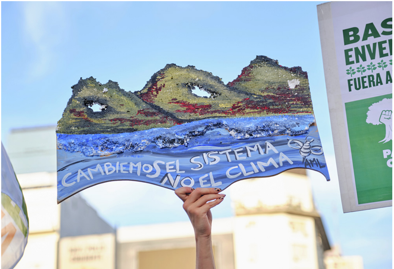
A protester holds up a sign saying in Spanish, "Let's change the system, not the climate," during a climate strike in Buenos Aires, Argentina, March 3.

The IPCC report "has strengthened the resolve of Catholic actors to advocate for climate action now," Laudato Si' Movement said in its letter, which it will present to national delegates at U.N. headquarters in New York City ahead of Earth Day (April 22). The letter is open for other Catholic groups to sign on, with 100 signatures so far, most representing organizations.