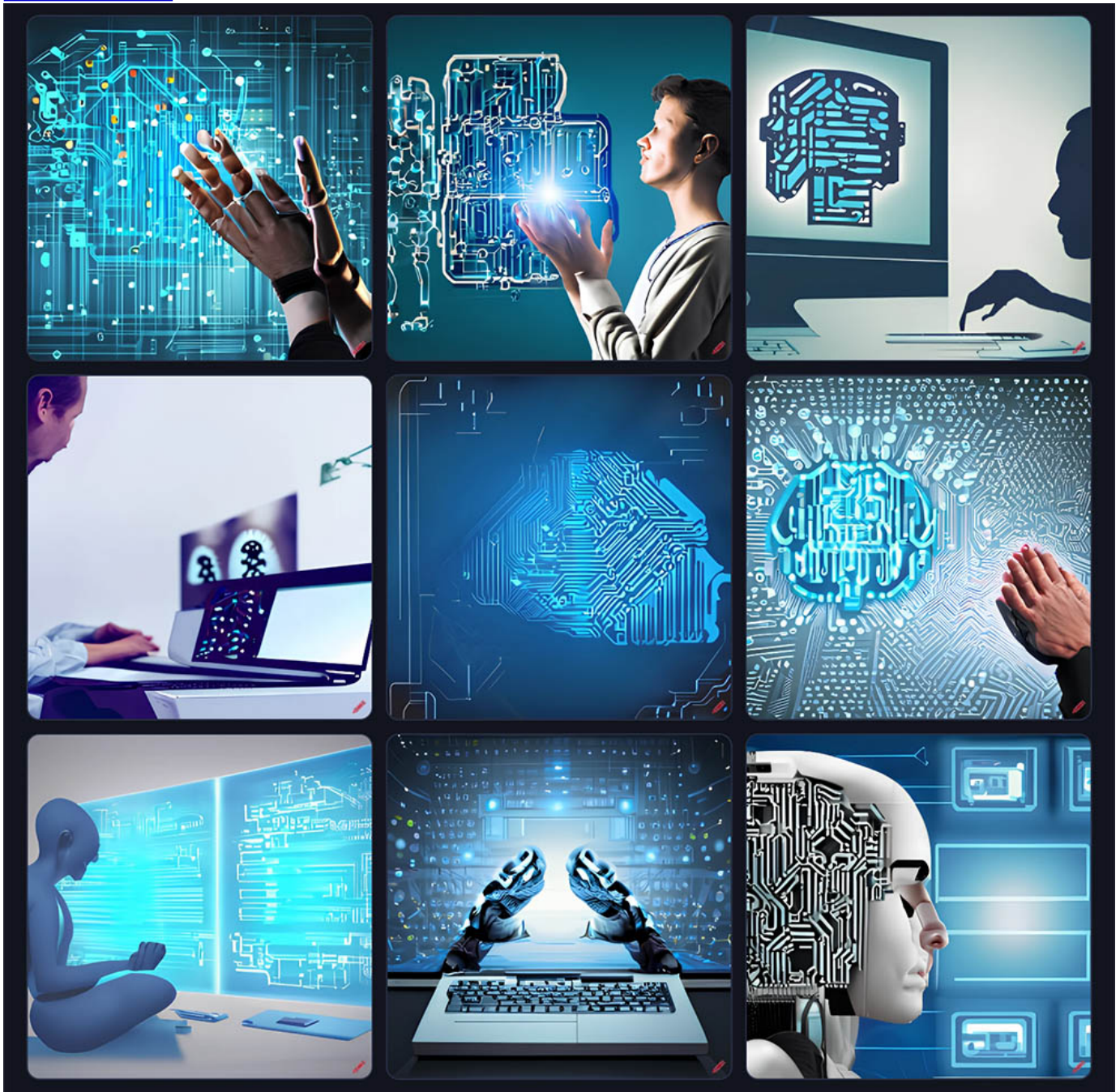
AI images generated from the prompt "a computer praying about artificial intelligence" (Craiyon)