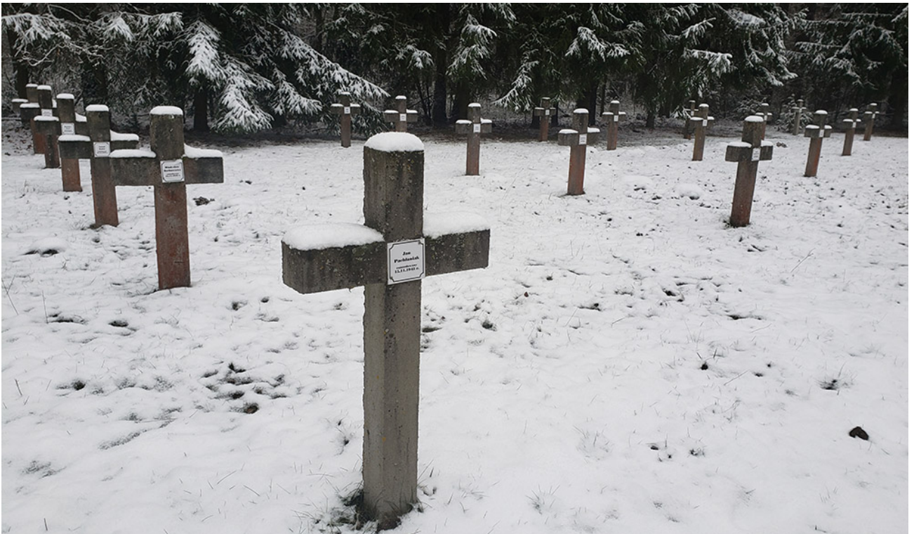
Dozens of non-Jewish Polish prisoners, presumably Catholic and also murdered at Treblinka, are named individually on crosses in a symbolic cemetery at the