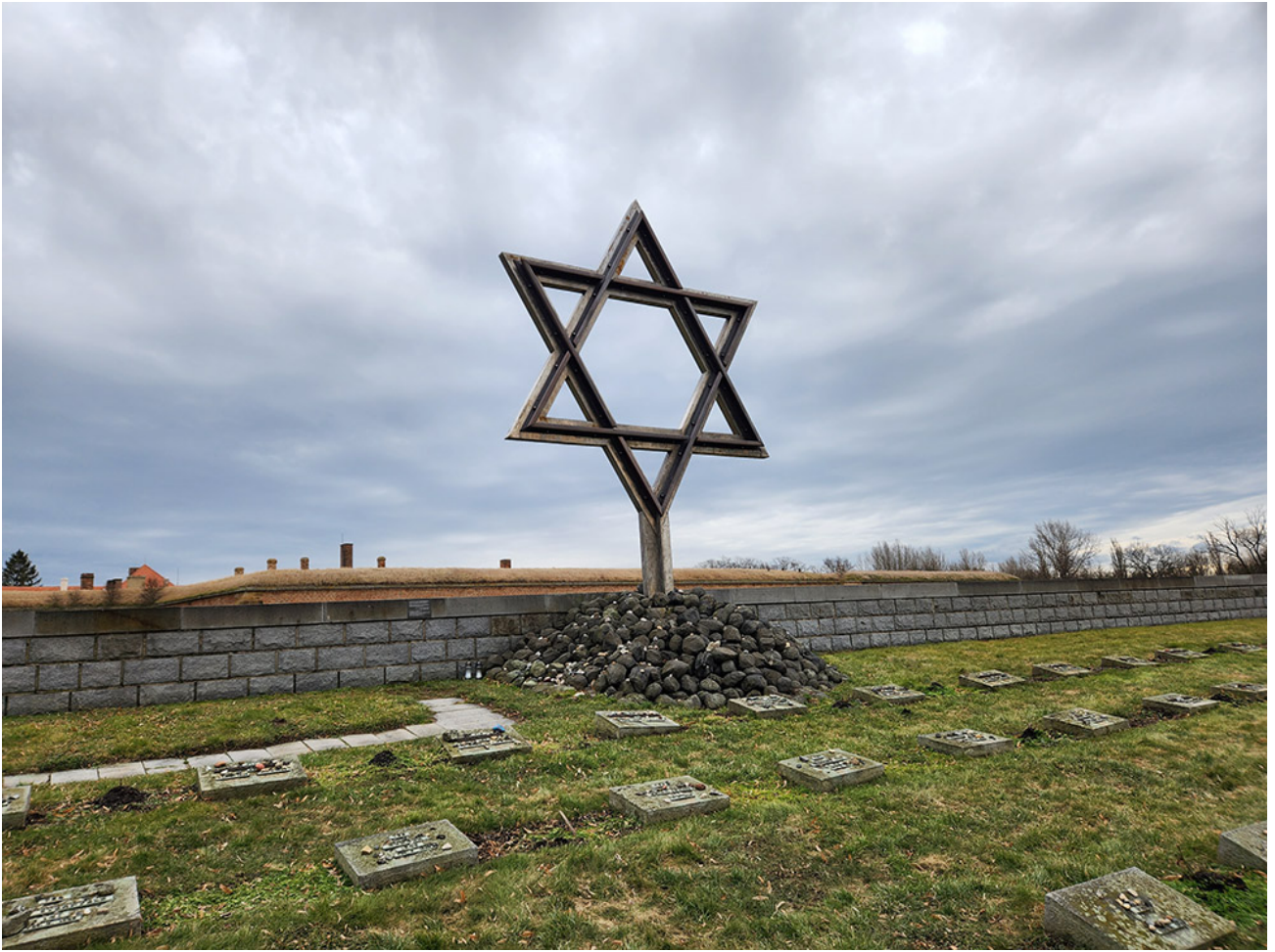
A cemetery near a prisoner and labor camp in the Czech Republic known in German as Theresienstadt honors the Jewish dead.