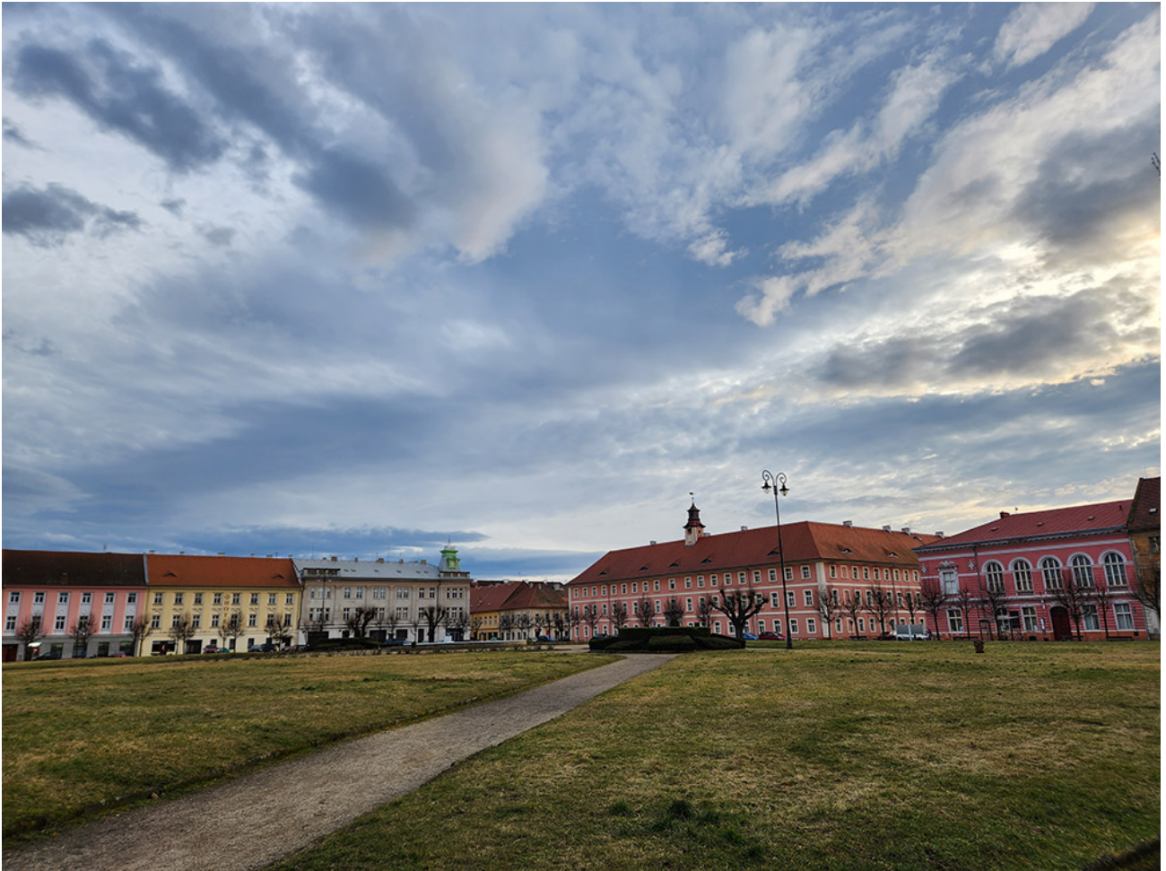
The square in Terezín, Czech Republic, site of a famous ghetto for Jewish prisoners and deportees during World War II.