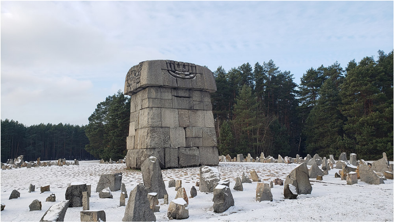
Poland's Treblinka memorial site, where as many as 900,000 Jews were murdered.