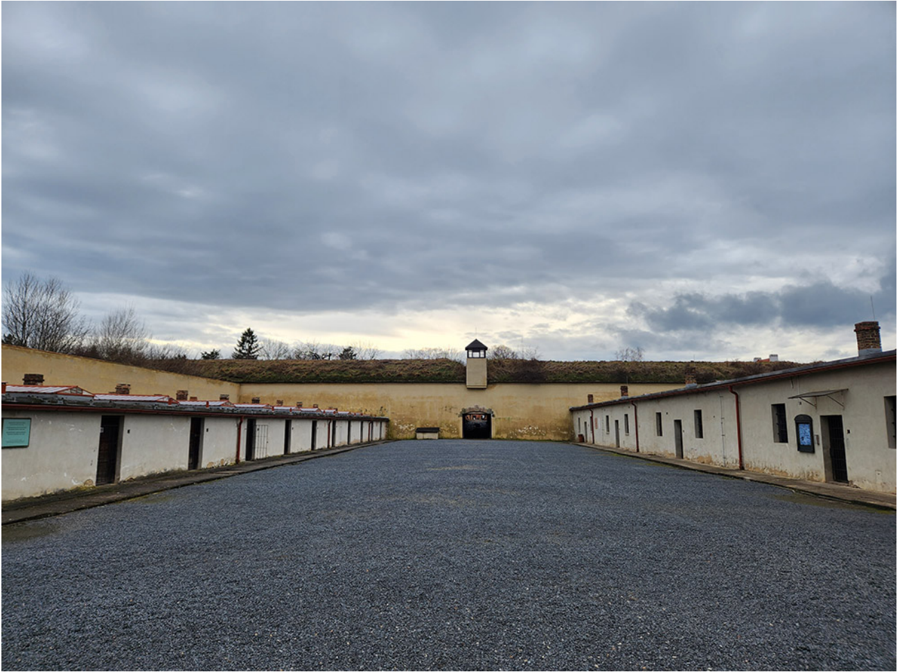
The prison camp in the Czech Republic known in German as Theresienstadt.