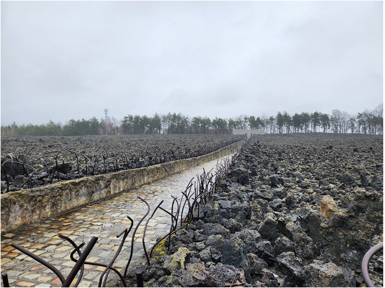
Belzec in Poland was the third-deadliest camp after Auschwitz-Birkenau and Treblinka.

How to make sense of all of this, particularly with the eruption of another European war?