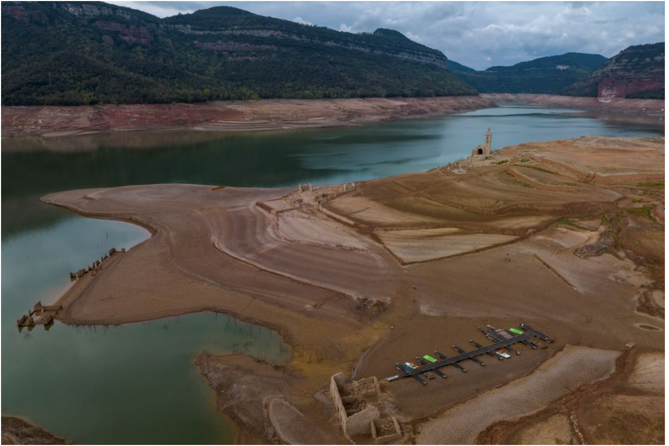
Dry, cracked land is visible around at the Sau reservoir, about 100 km (62 miles) north of Barcelona, Spain, Tuesday, April 18, 2023.