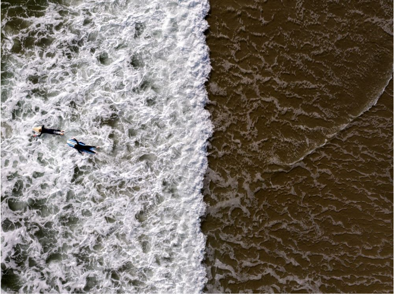
Two surfers waded through water in Huntington Beach, Calif., Monday, April 17, 2023.